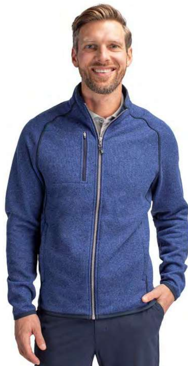
Mainsail Sweater-Knit Men's Full Zip Jacket

Our high quality Mainsail sweater-knit fleece is incredibly comfortable, with brushed fleece inside for a cozy feel while maintaining breathability so you can be active and stay warm.