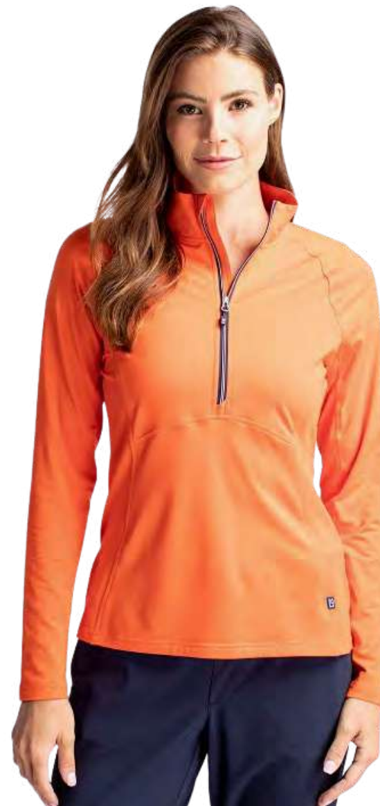
Adapt Eco Knit Stretch Recycled Women's Half Zip Pullover