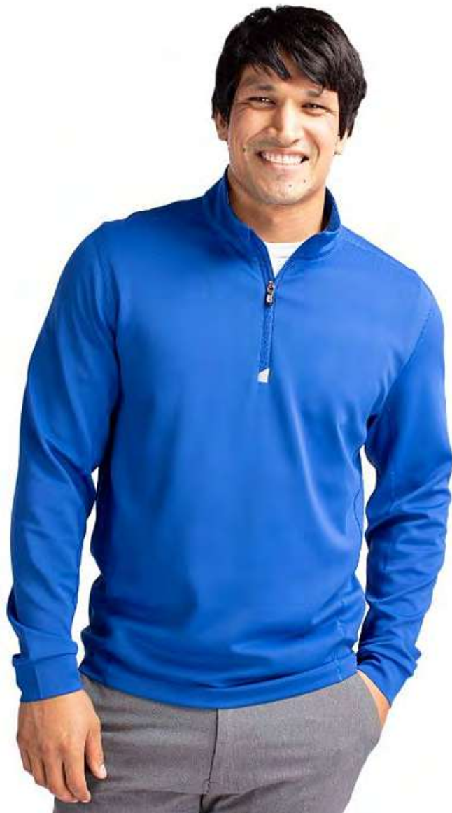
Traverse Stretch Quarter Zip Men's Pullover

The Traverse is made from a high quality 2-ply DryTec matte finish polyester that is blended with spandex in a double knit to achieve exceptional durability, stretch for comfort, and UPF 50+, all with a supremely smooth and modern look.