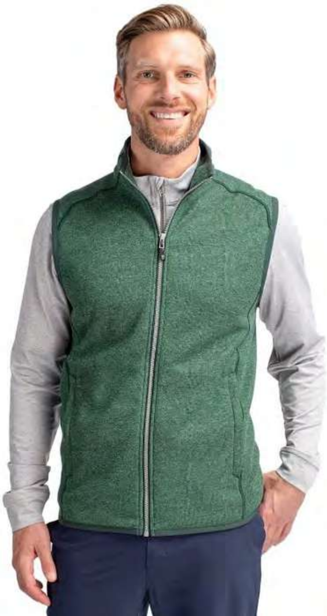
Mainsail Sweater-Knit Men's Full Zip Vest

Our high quality Mainsail sweater-knit fleece is incredibly comfortable, with brushed fleece inside for a cozy feel while maintaining breathability so you can be active and stay warm.