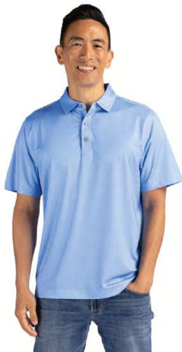
Pike Eco Tonal Geo Print Stretch Recycled Mens Polo