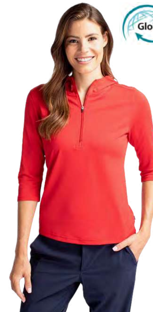
Virtue Eco Pique Recycled Women's Half Zip Hoodie