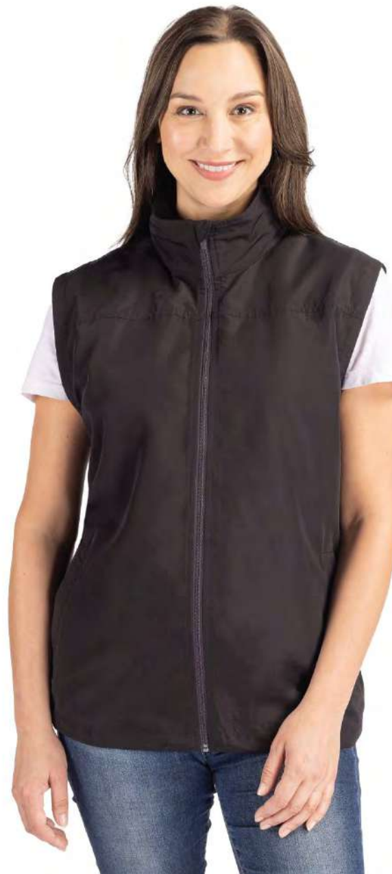
Charter Eco Recycled Women's Full-Zip Vest