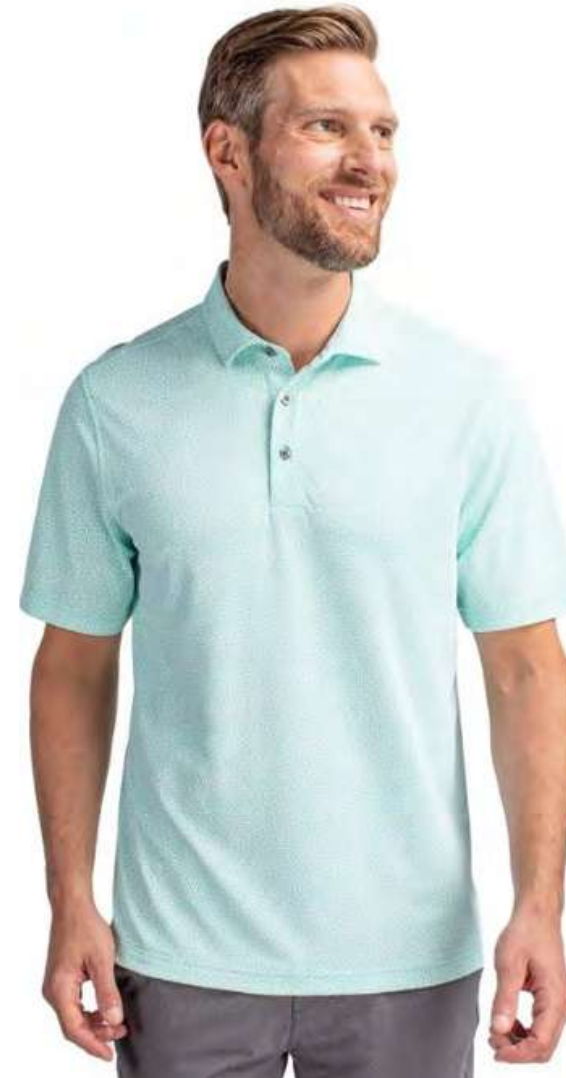
Virtue Eco Pique Botanical Print Recycled Men's Polo