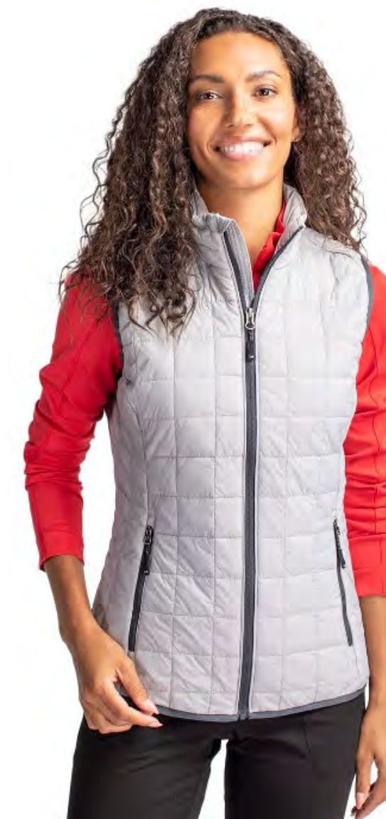
Rainier Eco Insulated Women's Full Zip Puffer Vest