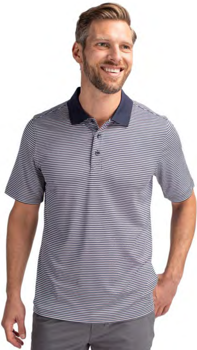
Forge Tonal Stripe Stretch Men's Polo MCK00113 $95MSRP