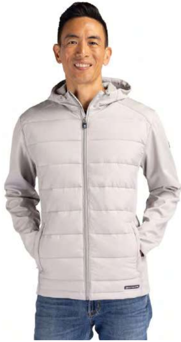
Evoke Hybrid Eco Softshell Recycled Full Zip Mens Hooded Jacket MCO00077 $245 MSRP