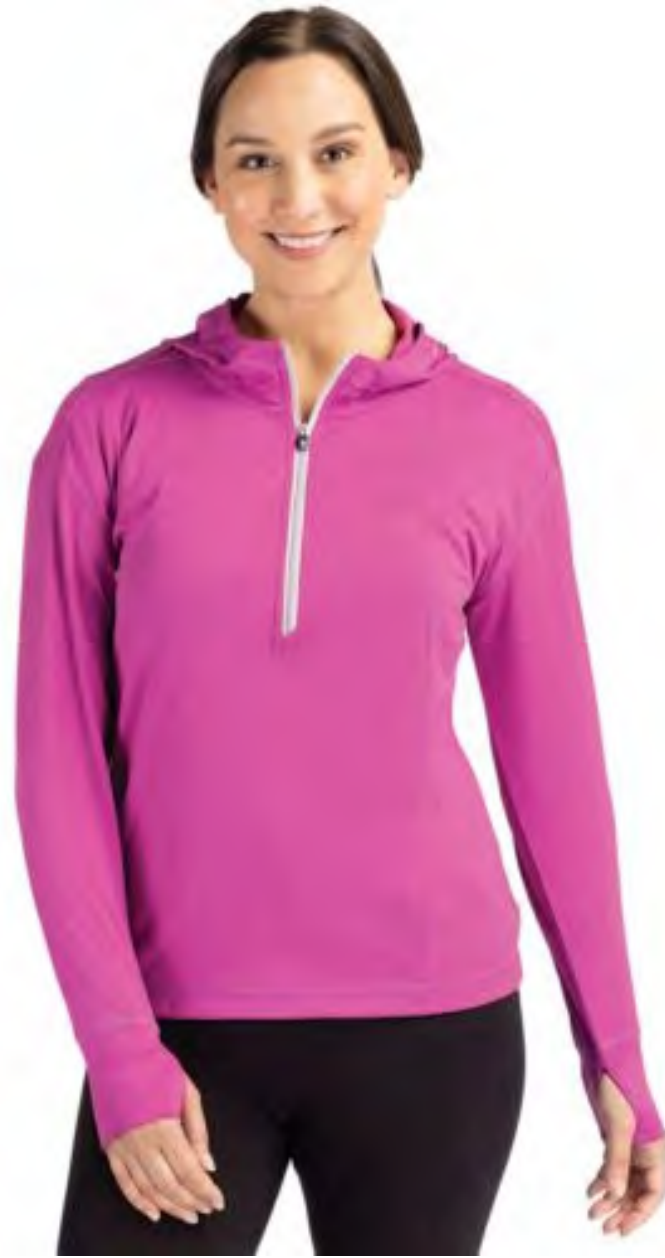
Daybreak Eco Recycled Womens Half Zip Hoodie