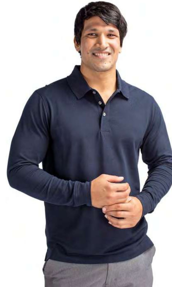
Advantage Tri-Blend Pique Men's Long Sleeve Polo