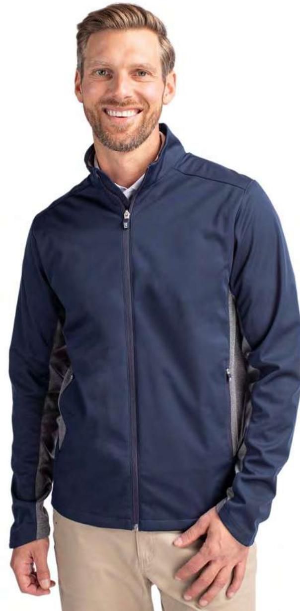
Navigate Softshell Men's Full Zip Jacket MCO00038 $130 MSRP

High quality, stretchy and breathable, the Navigate bonded softshell is wind, water and rain resistant, so you can make the most of your everyday adventures.