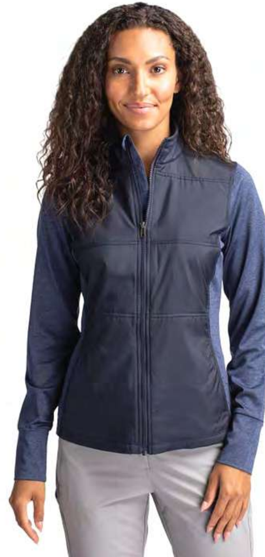
Stealth Hybrid Quilted Women's Windbreaker Jacket