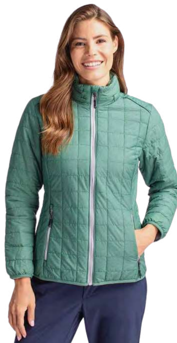
Rainier Eco Insulated Women's Full Zip Puffer Jacket