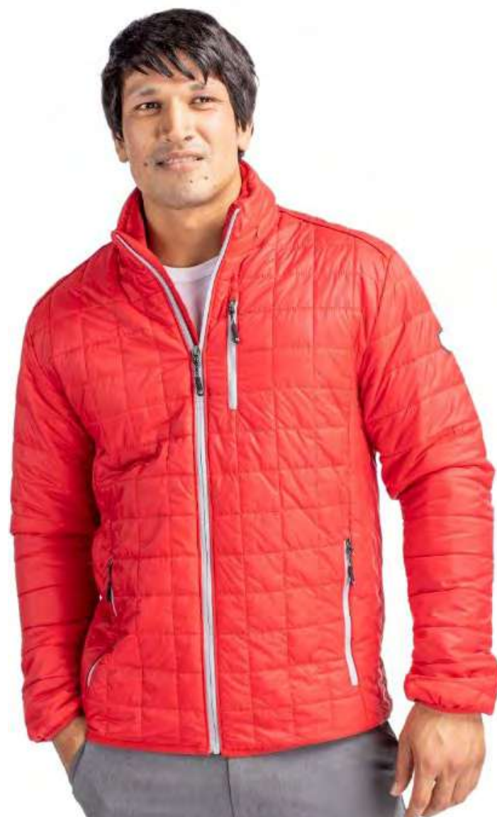
Rainier Eco Insulated Men's Full Zip Puffer Jacket

Engineered from lightweight, recycled, Primaloft® Silver Insulation for exceptional four season versatility, our Rainier jackets and vests are designed to be your favorite packable outerwear perfect for everyday travel and adventures.