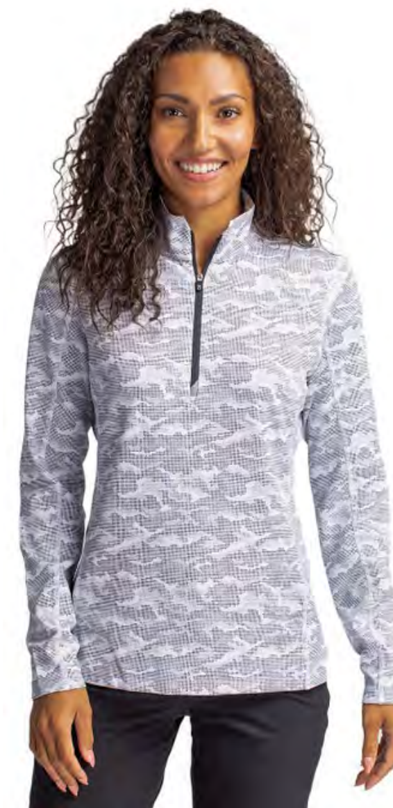
Traverse Camo Print Stretch Quarter Zip Women's Pullover