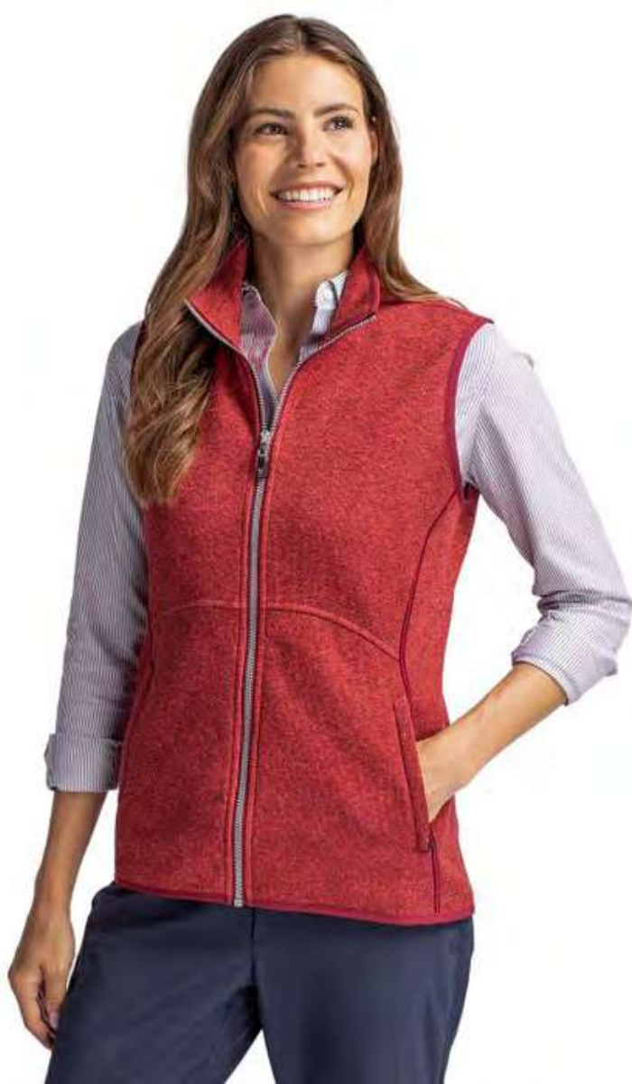
Mainsail Sweater-Knit Women's Full Zip Vest