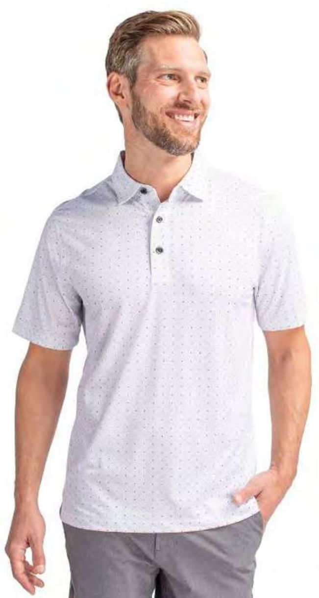
Pike Double Dot Print Stretch Men's Polo MCK00137 $95 MSRP