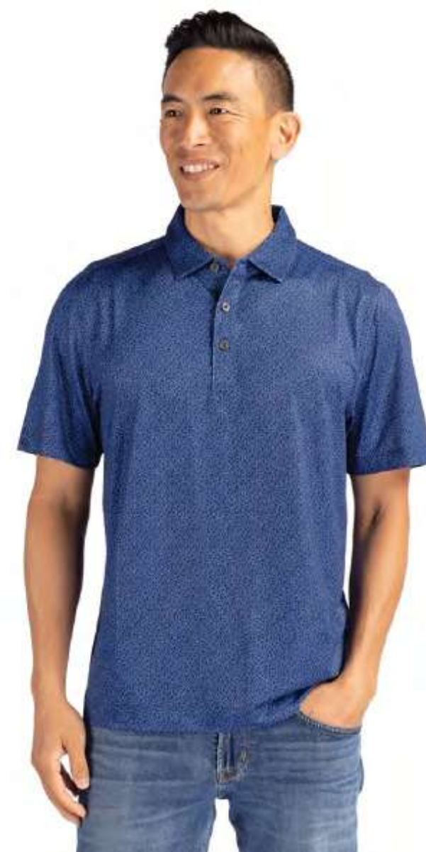
Pike Eco Pebble Print Stretch Recycled Mens Polo