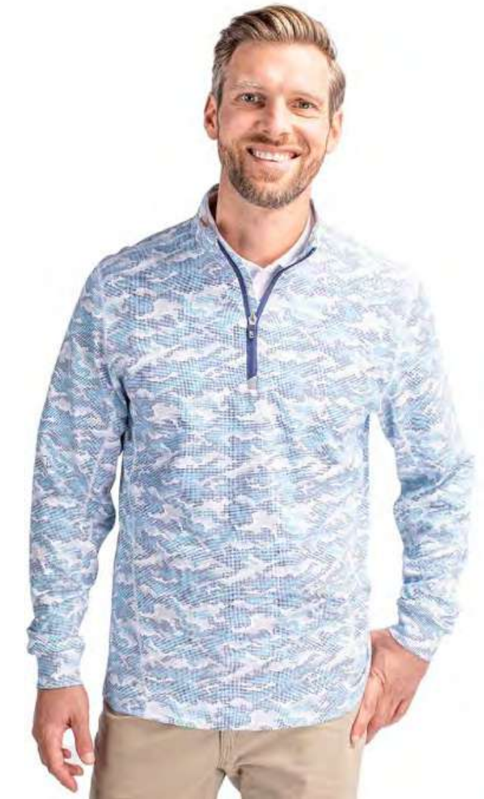
Traverse Camo Print Stretch Quarter Zip Men's Pullover