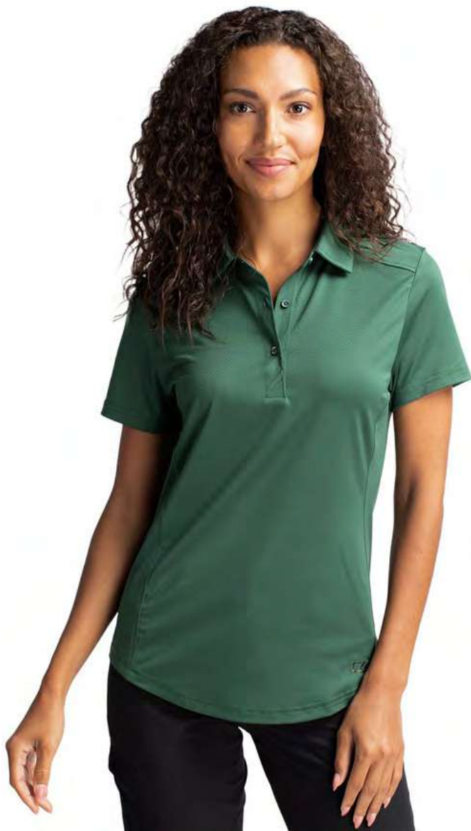
Prospect Textured Stretch Women's Short Sleeve Polo