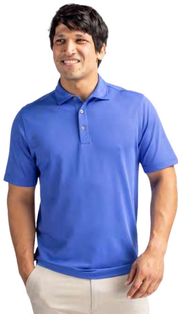
Virtue Eco Pique Recycled Men's Polo

Our Virtue Eco Pique polos and tops are made from an ultra-lightweight, high quality certified eco-friendly recycled Drytec polyester is blended with spandex for stretch, a cooling effect, and UPF sun protection, resulting in the most versatile, sustainable, and comfortable pique fabric we have ever made.