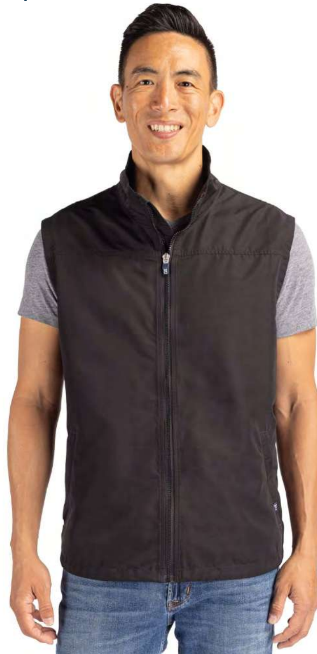
Charter Eco Recycled Men's Full-Zip Vest