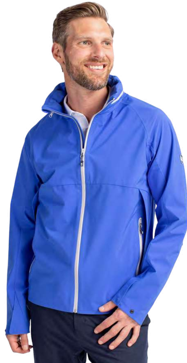
Vapor Water Repellent Stretch Men's Full Zip Rain Jacket

Thoughtfully engineered for exceptional versatility, our high quality WeatherTec polyester is blended with spandex, and laminated in three layers to repel rain while maintaining exceptional comfort and style.