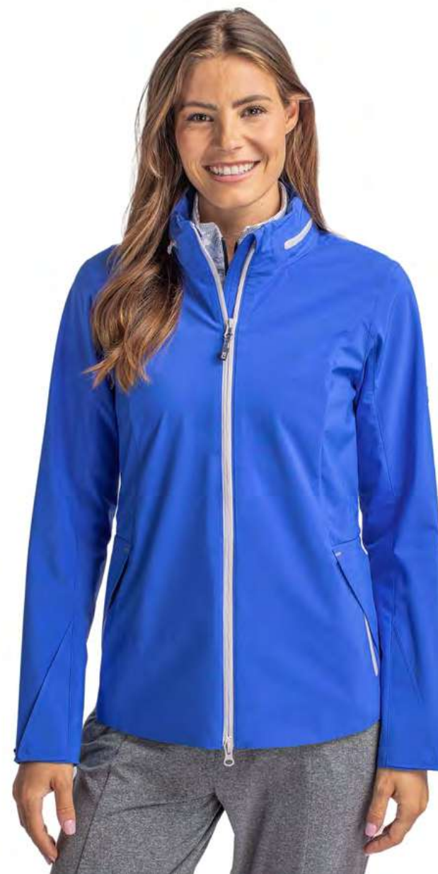
Vapor Water Repellent Stretch Women's Full Zip Rain Jacket