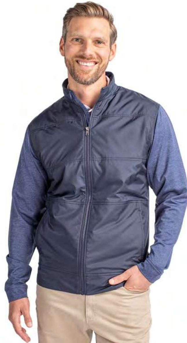
Stealth Hybrid Quilted Men's Windbreaker Jacket

The Stealth Collection is made from high-quality moisture-wicking DryTec polyester blended with spandex for comfort, stretch, and durability. Both the jacket and vest incorporate a lightly quilted water resistant fabric to the body, resulting in the most versatile mid-layer you'll reach for year-round.