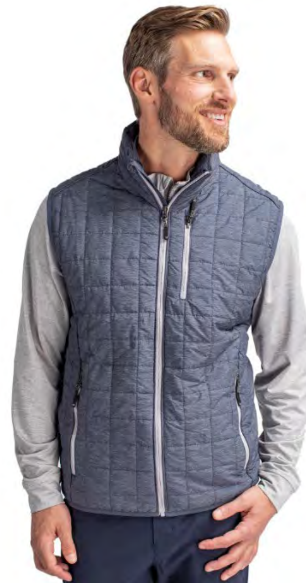
Rainier Eco Insulated Men's Full Zip Puffer Vest