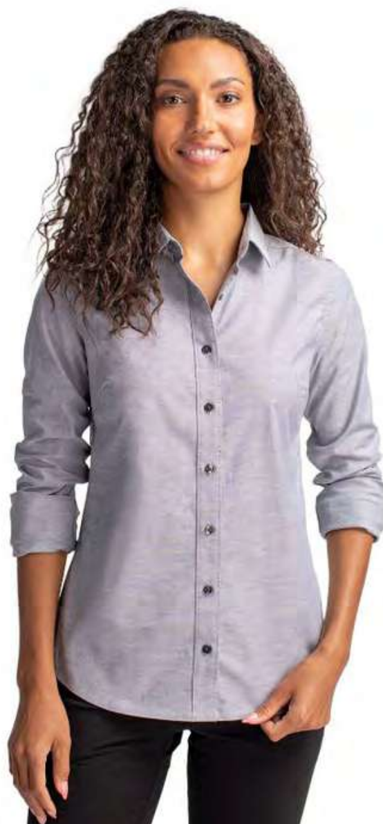
Stretch Oxford Women's Long Sleeve Dress Shirt