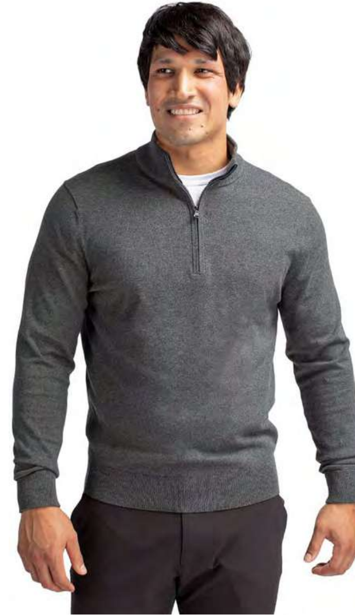
Lakemont Tri-Blend Men's Quarter Zip Pullover Sweater