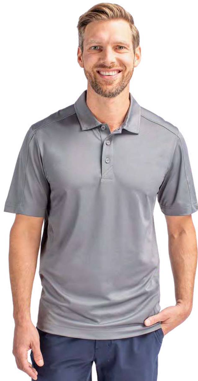
Prospect Textured Stretch Men's Short Sleeve Polo

This high quality, modern, ultra-fine textured jacquard is smooth against the skin by combining DryTec polyester and spandex to achieve incredible comfort, moisture wicking for a cooling effect, and amazing stretch to keep you looking sharp for years.