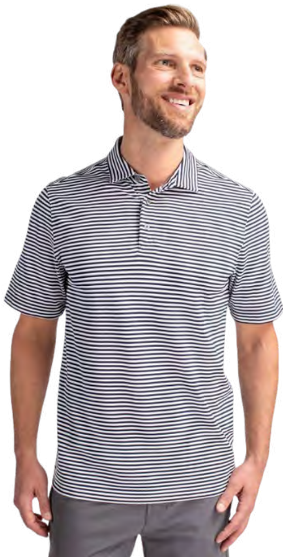
Virtue Eco Pique Stripe Recycled Men's Polo

Our Virtue Eco Pique polos and tops are made from an ultra-lightweight, high quality certified eco-friendly recycled Drytec polyester is blended with spandex for stretch, a cooling effect, and UPF sun protection, resulting in the most versatile, sustainable, and comfortable pique fabric we have ever made.