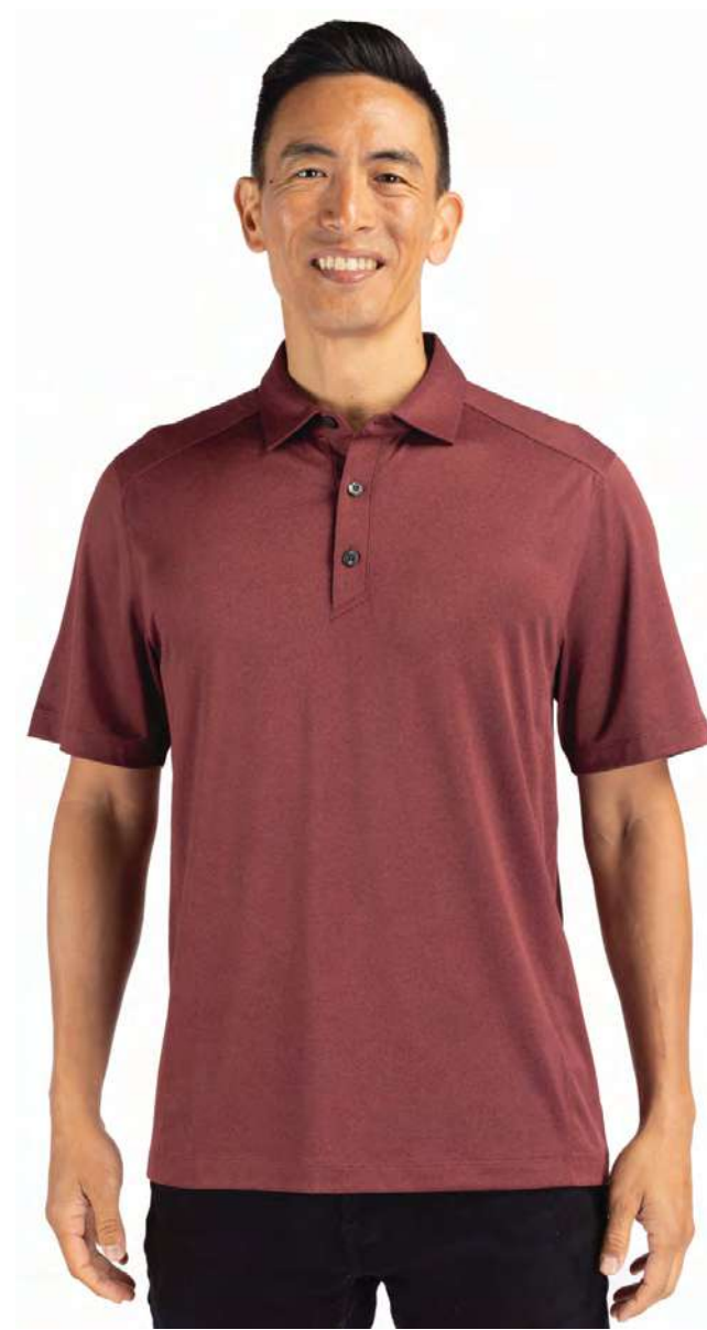
Forge Eco Stretch Recycled Heathered Mens Polo