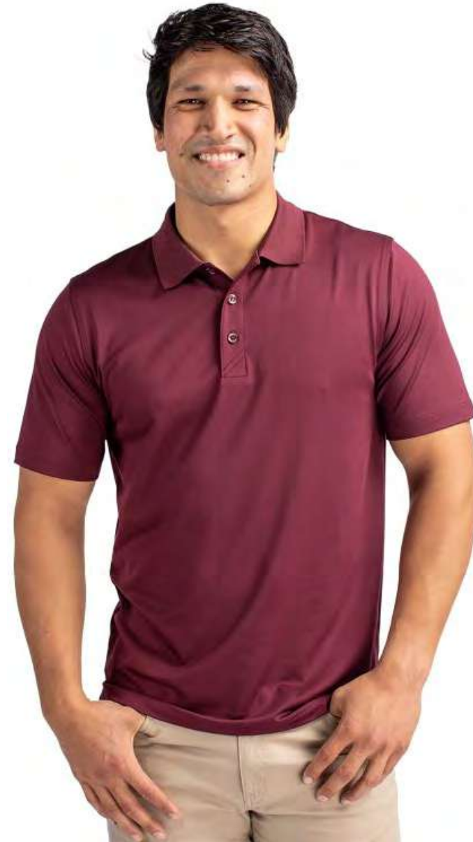
Forge Stretch Men's Short Sleeve Polo