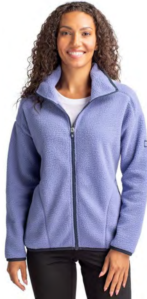
Cascade Eco Sherpa Women's Fleece Jacket