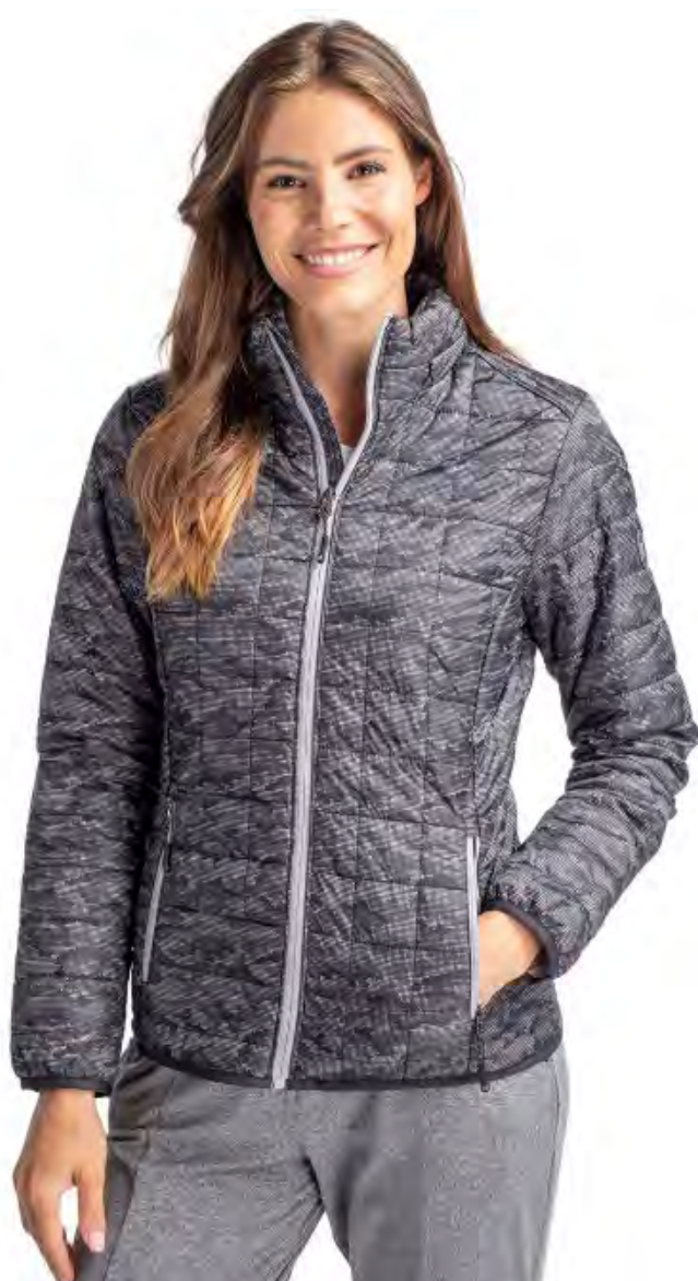
Rainier Eco Insulated Women's Full Zip Printed Puffer Jacket LCO00053 $245 MSRP