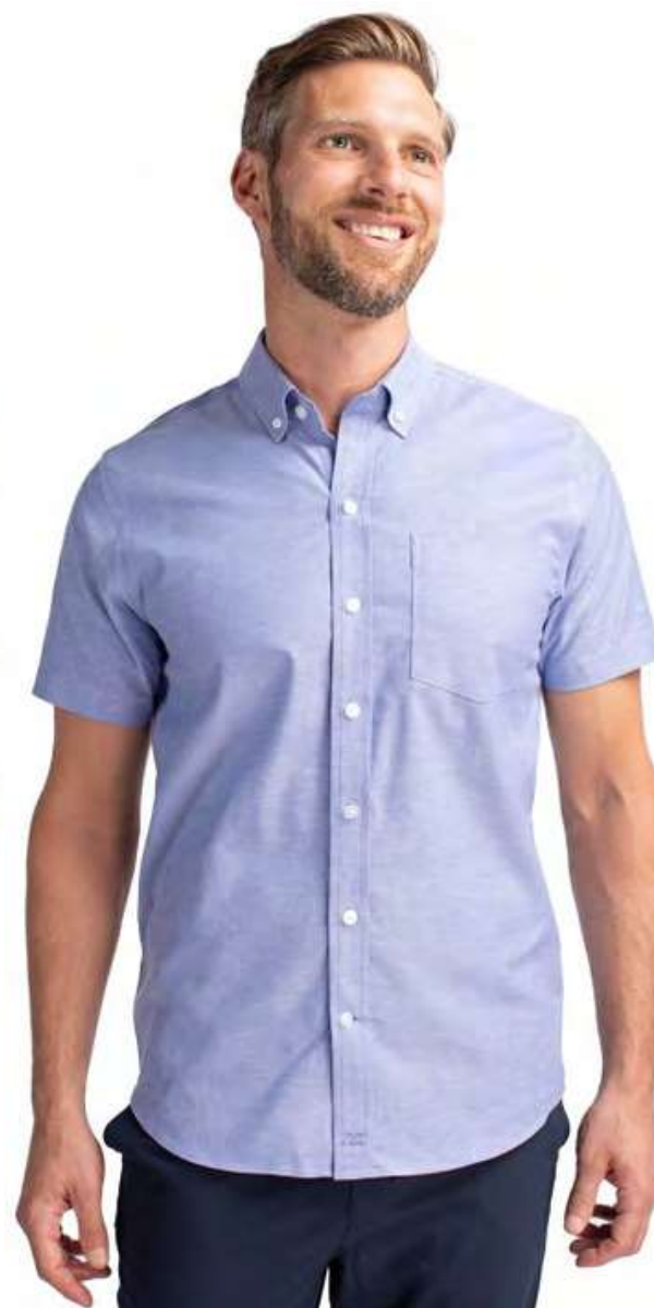
Stretch Oxford Men's Short Sleeve Dress Shirt