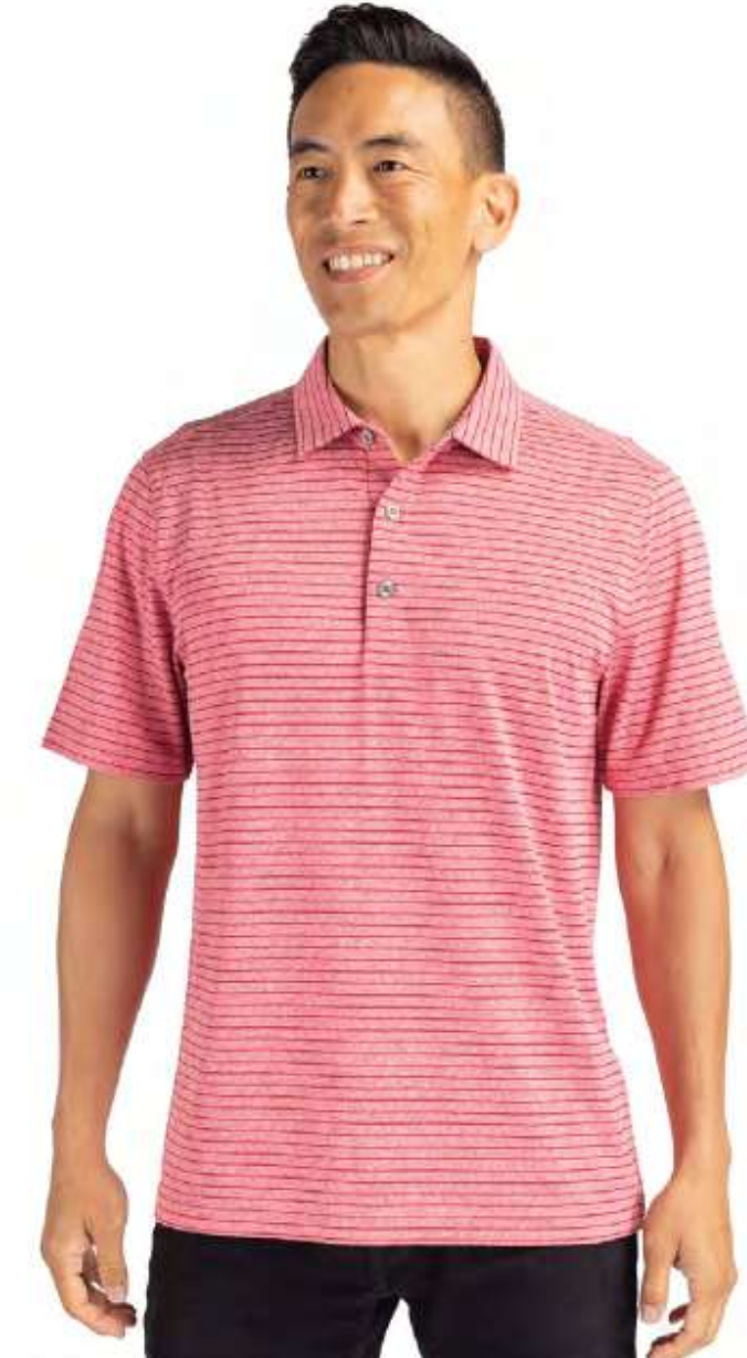
Forge Eco Heather Stripe Stretch Recycled Mens Polo