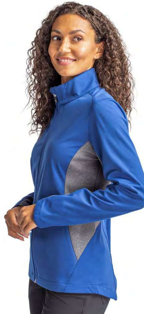
Navigate Softshell Women's Full Zip Jacket LCO00032 $130 MSRP