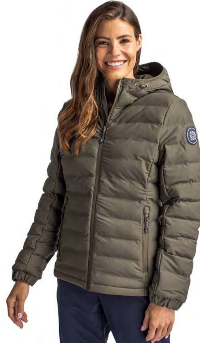
Mission Ridge Eco Insulated Women's Puffer Jacket