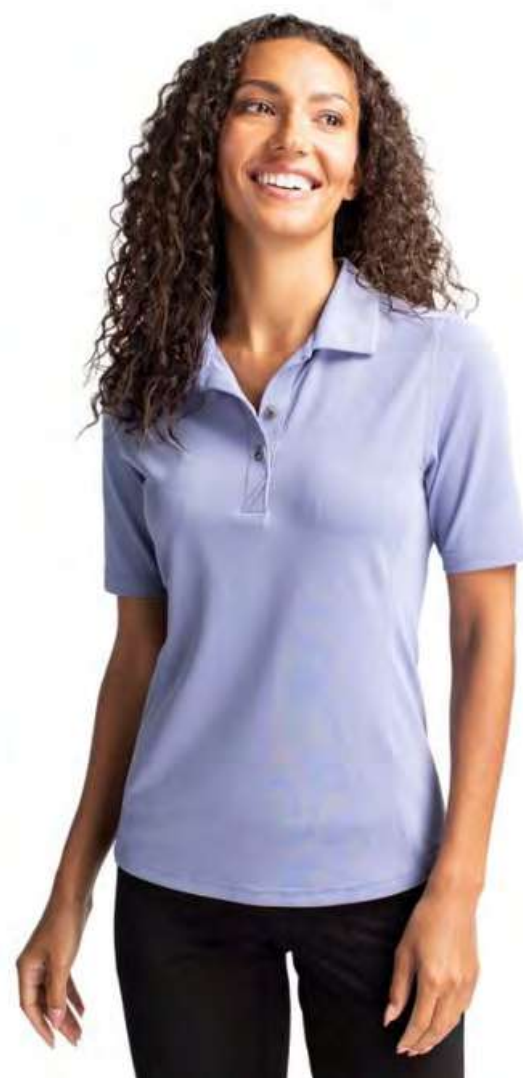
Virtue Eco Pique Recycled Women's Polo