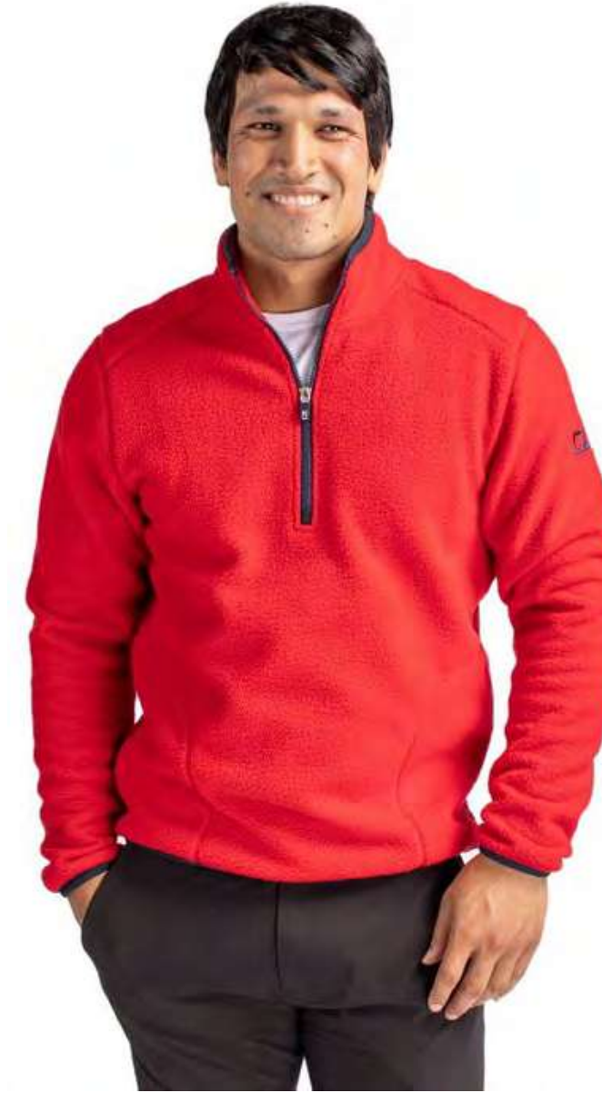
Cascade Eco Sherpa Fleece Men's Quarter Zip Jacket