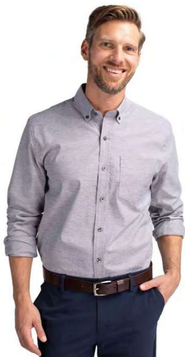
Stretch Oxford Men's Long Sleeve Dress Shirt

Perfect for busy days, our high quality Stretch fabric is super comfortable, with all-day crispness, and it'll look great right-out-of-the-dryer.