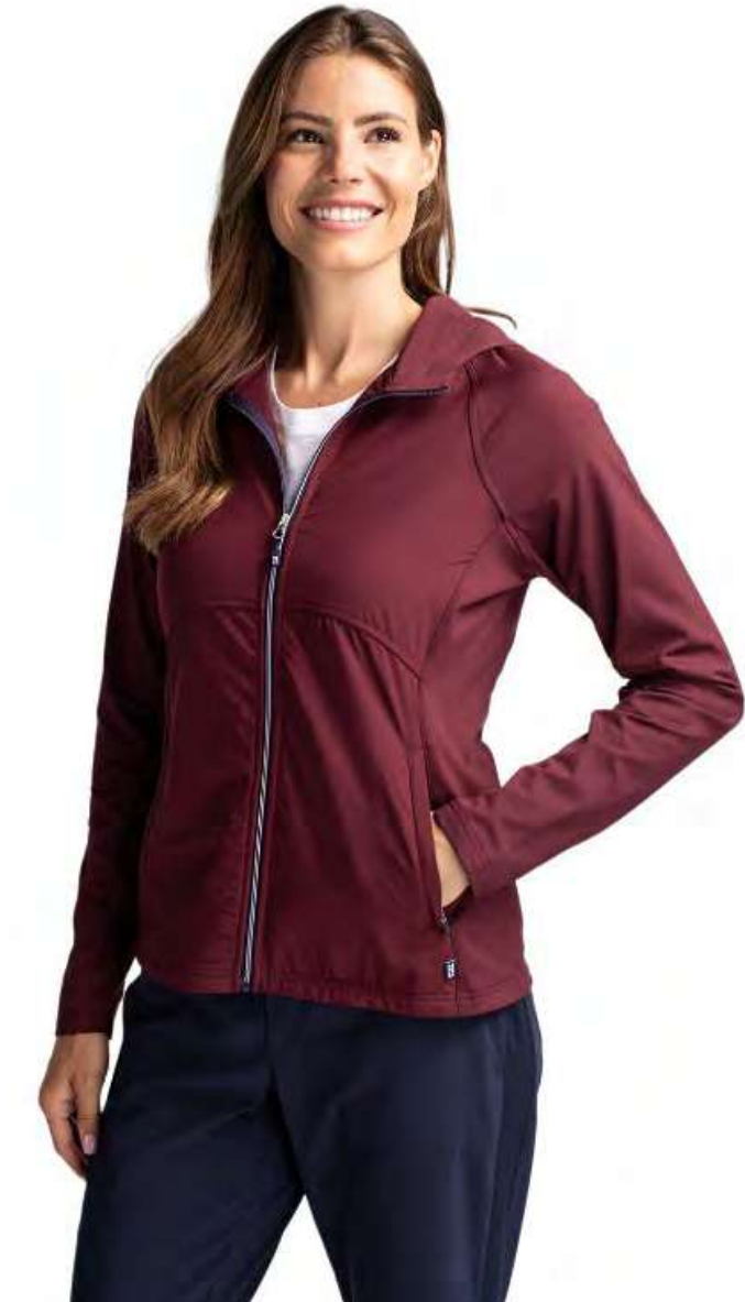
Adapt Eco Knit Hybrid Recycled Women's Full Zip Jacket