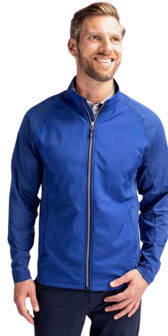
Adapt Eco Knit Hybrid Recycled Men's Full Zip Jacket