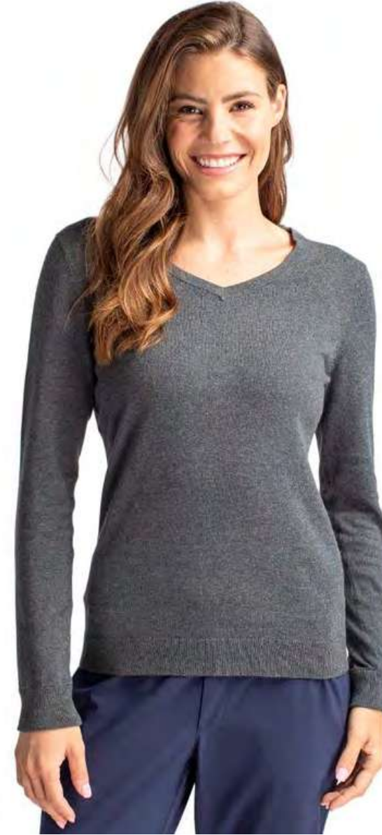
Lakemont Tri-Blend Women's V-Neck Pullover Sweater