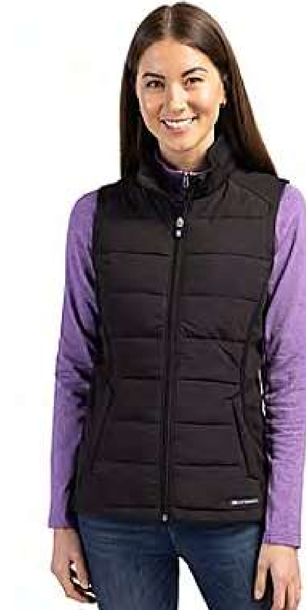
Evoke Hybrid Eco Softshell Recycled Womens Full Zip Vest LCO00065 $225 MSRP