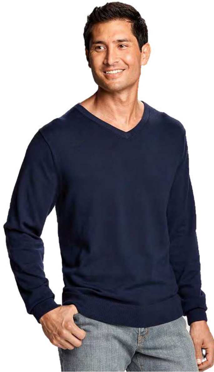
Lakemont Tri-Blend Men's V-Neck Pullover Sweater

Our high quality Lakemont tri-blend sweaters are crafted from super soft cotton that is blended with nylon for durability, and spandex for stretch so you can have amazing comfort, packable convenience, all with wash at home ease.