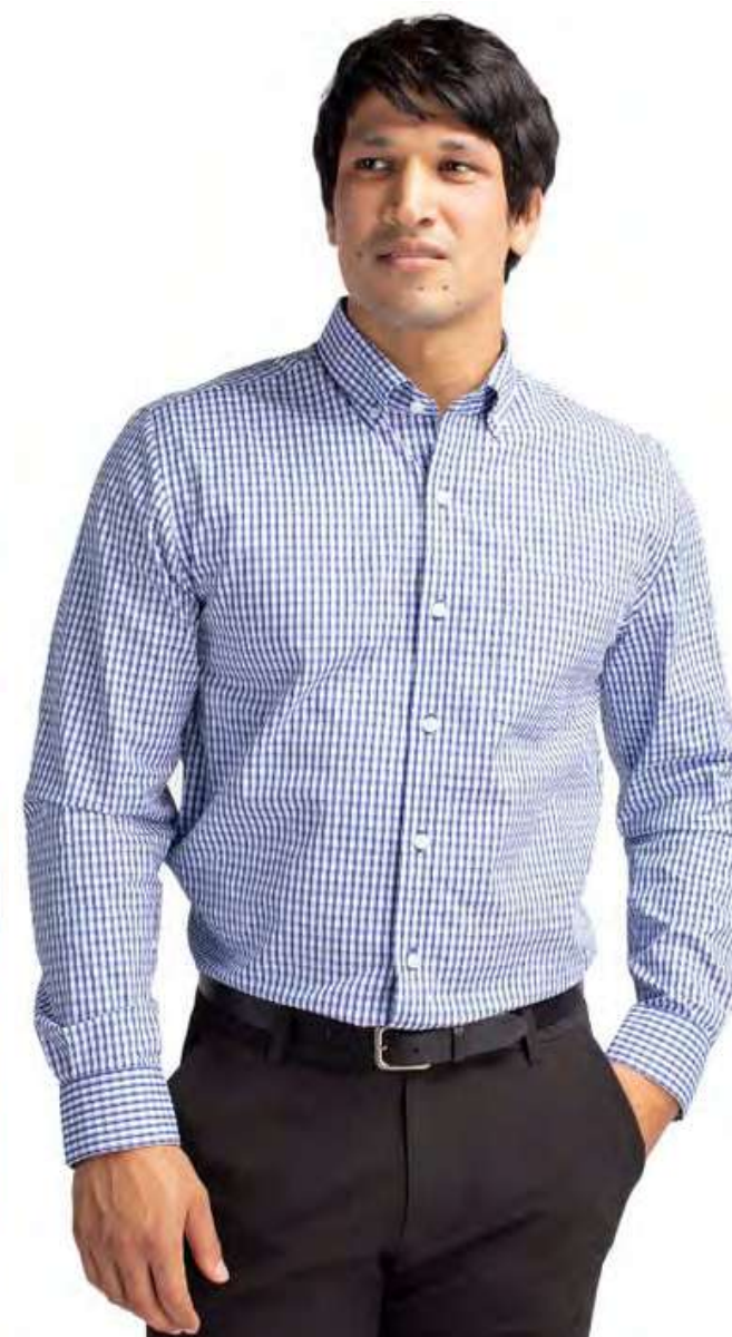
Stretch Gingham Men's Long Sleeve Dress Shirt