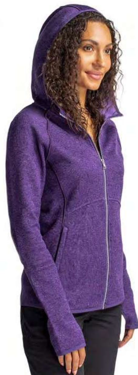
Mainsail Sweater-Knit Hoodie Women's Full Zip Jacket