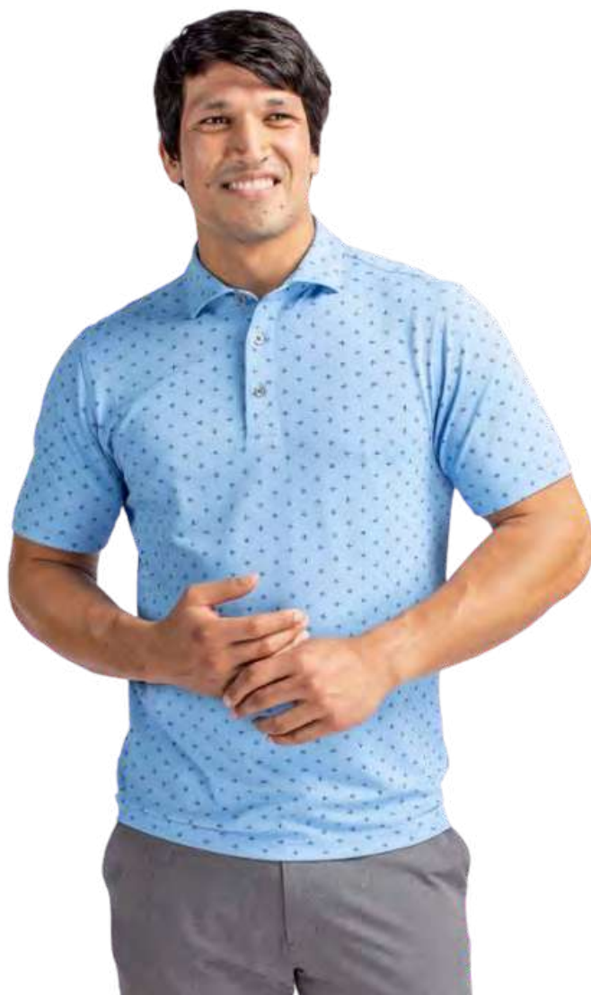
Virtue Eco Pique Tile Print Recycled Men's Polo