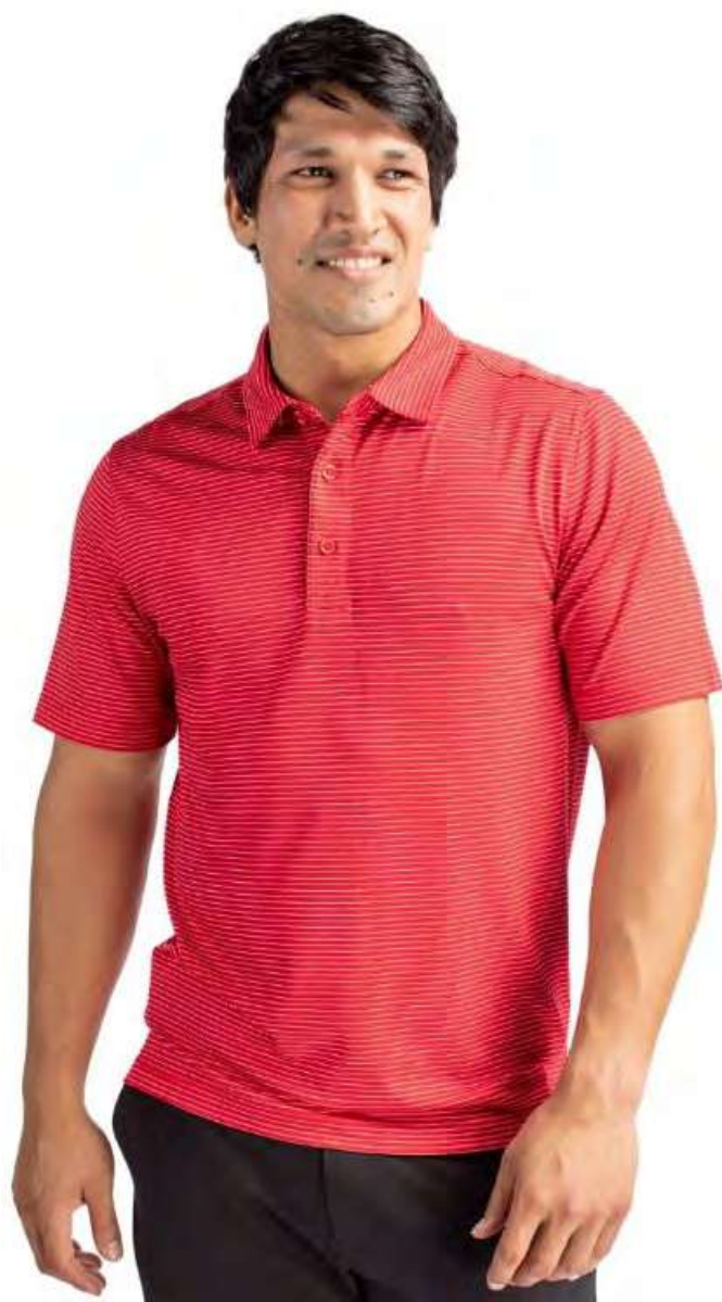
Forge Pencil Stripe Stretch Men's Polo MCK00144 $90 MSRP