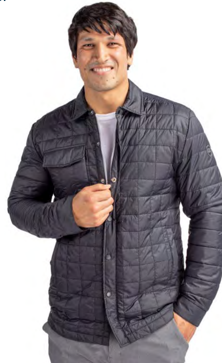
Rainier Eco Insulated Men's Quilted Shirt Jacket