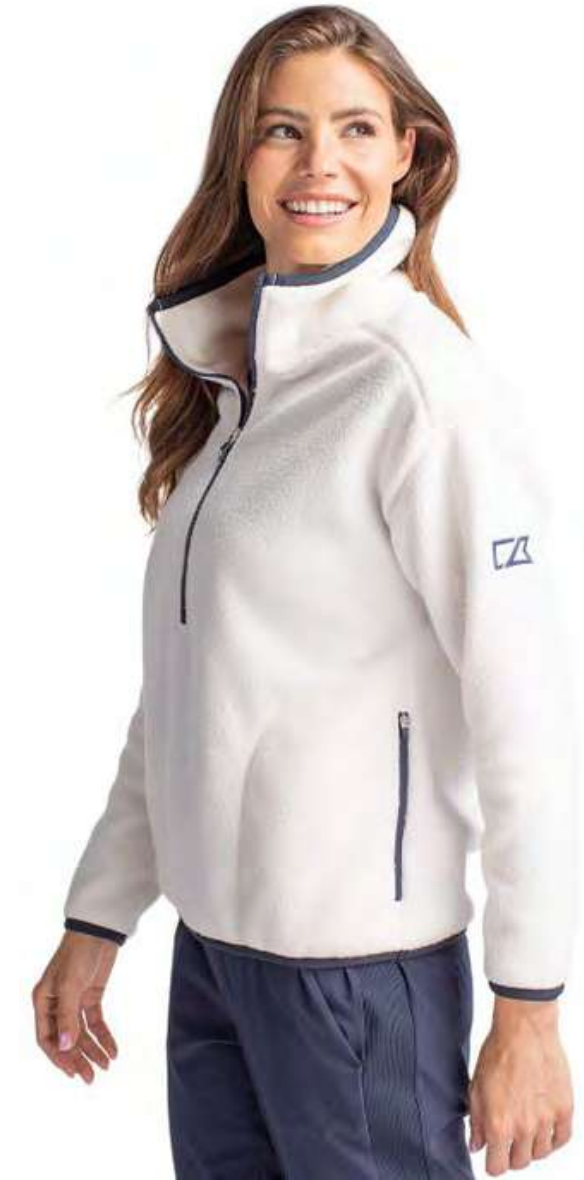
Cascade Eco Sherpa Women's Fleece Pullover Jacket