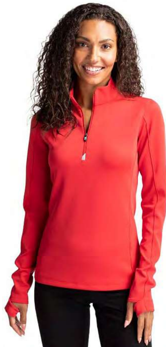
Traverse Stretch Quarter Zip Women's Pullover