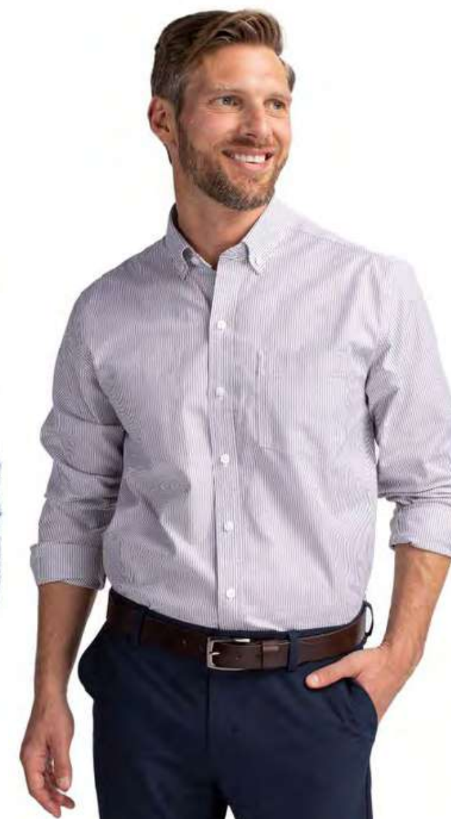
Stretch Oxford Stripe Men's Long Sleeve Dress Shirt