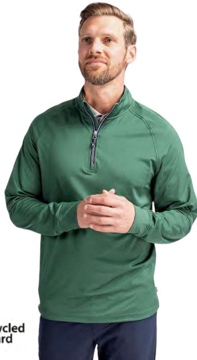
Adapt Eco Knit Stretch Recycled Men's Quarter Zip Pullover

Our Adapt Eco Knit layering styles are made with a supremely comfortable and lightweight brushed back fleece that is blended from high quality certified eco-friendly recycled DryTec polyester with spandex for stretch and warmth against the skin so you can do well for yourself and the planet.