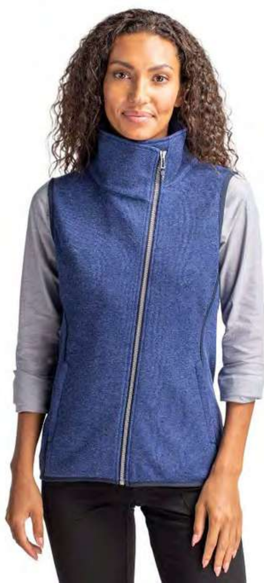
Mainsail Sweater-Knit Women's Asymmetrical Vest