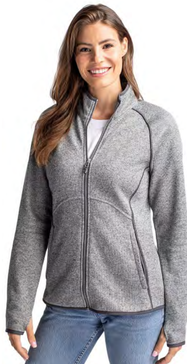
Mainsail Sweater-Knit Women's Full Zip Jacket