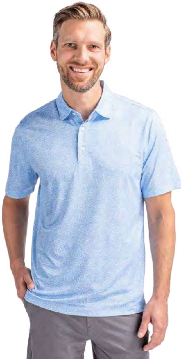
Pike Constellation Print Stretch Men's Polo MCK01133 $95 MSRP