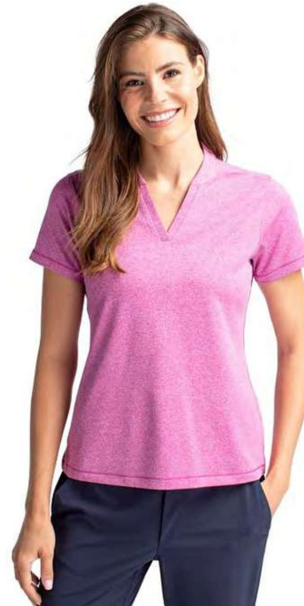
Forge Heathered Stretch Women's Blade Top