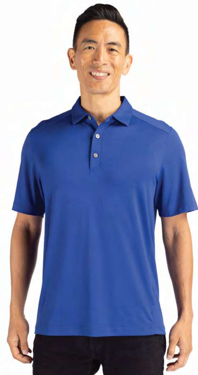
Forge Eco Stretch Recycled Mens Polo