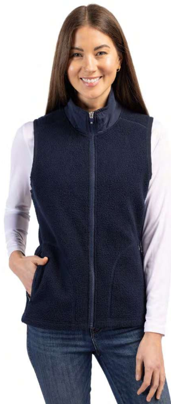
Cascade Eco Sherpa Womens Fleece Vest

Engineered for exceptional warmth and versatility, the high quality deep pile Cascade Eco Sherpa Fleece is incredibly comfortable, with brushed fleece inside for a cozy feel while maintaining breathability so you can be active and stay warm with unwavering quality and craftsmanship.