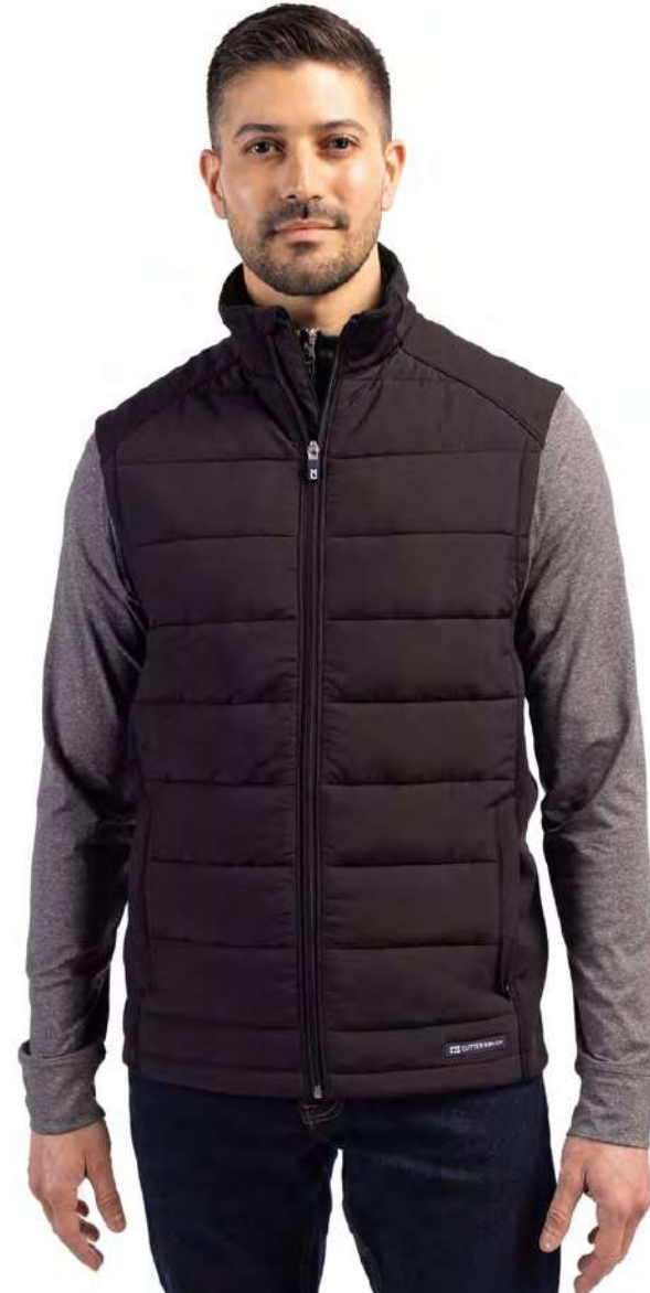
Evoke Hybrid Eco Softshell Recycled Mens Full Zip Vest MCO00076 $225 MSRP