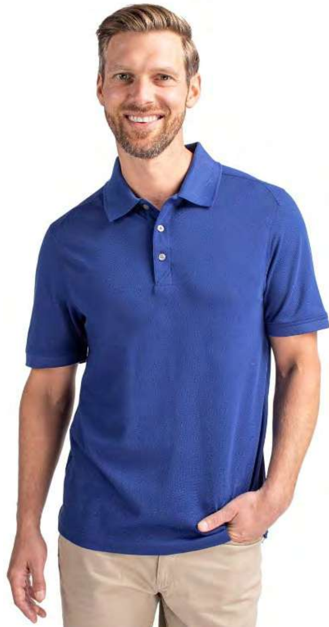
Advantage Tri-Blend Pique Men's Polo

Our high quality Advantage tri-blends combine super soft cotton with DryTec polyester and spandex to achieve incredible comfort along with moisture wicking to keep you cool all day long.