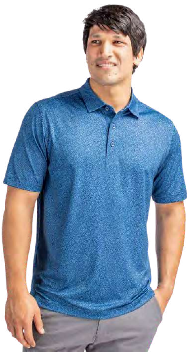
Pike Micro Floral Print Stretch Men's Polo MCK01055 $95 MSRP