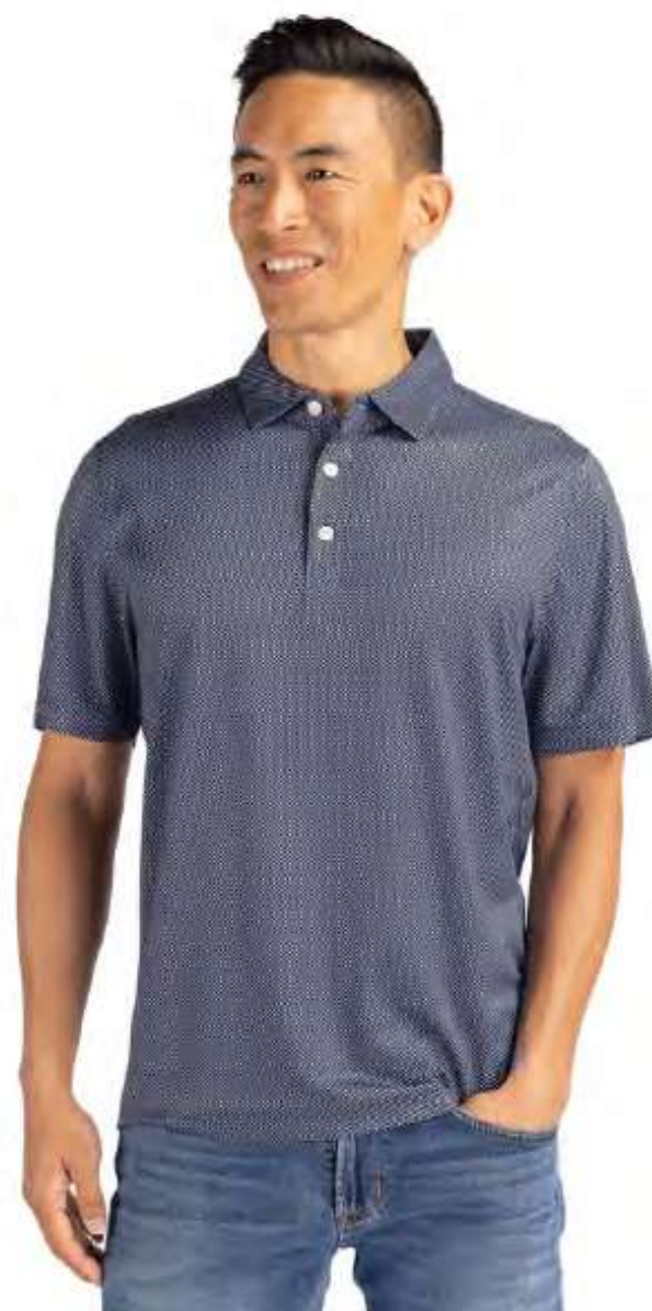
Pike Eco Symmetry Print Stretch Recycled Mens Polo