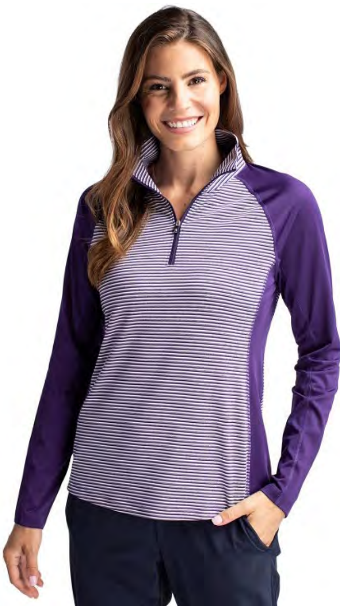
Forge Tonal Stripe Stretch Women's Half Zip Top LCK00068 $115 MSRP