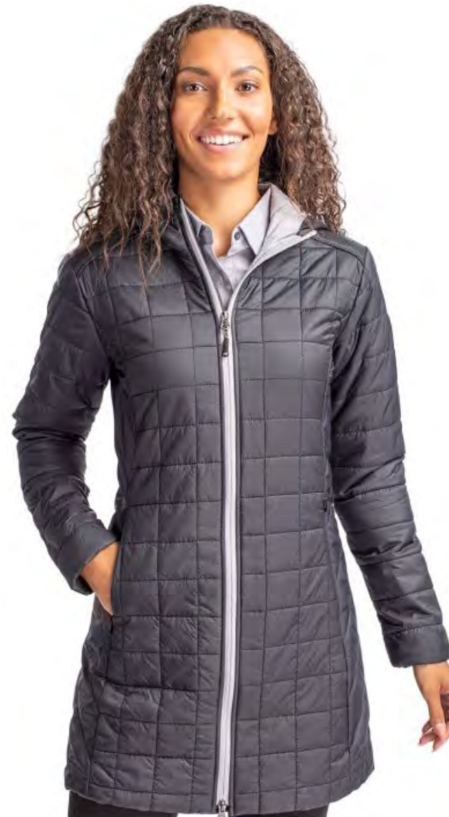
Rainier Eco Insulated Women's Hooded Long Coat