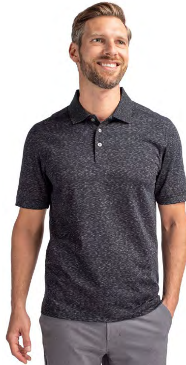
Advantage Tri-Blend Space Dye Men's Polo