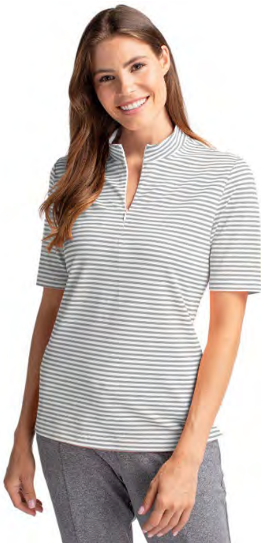
Virtue Eco Pique Stripe Recycled Women's Top