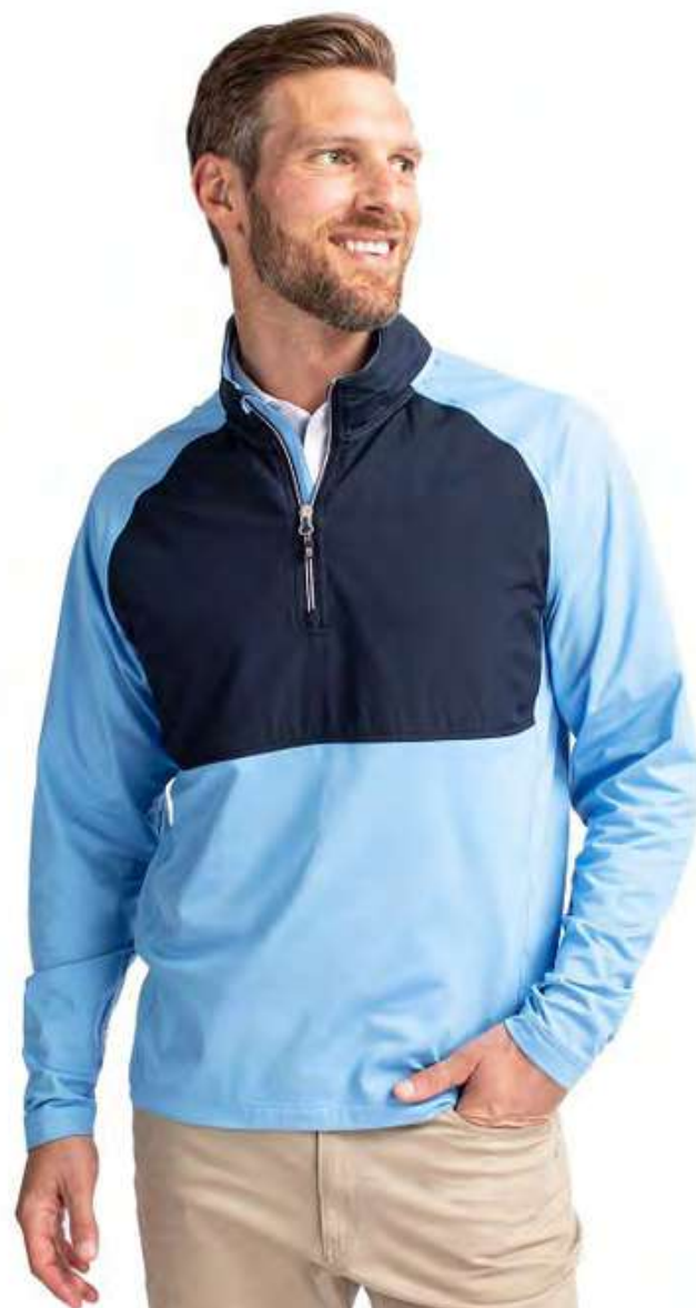
Adapt Eco Knit Hybrid Recycled Men's Quarter Zip

Our Adapt Eco Knit layering styles are made with a supremely comfortable and lightweight brushed back fleece that is blended from high quality certified eco-friendly recycled DryTec polyester with spandex for stretch and warmth against the skin so you can do well for yourself and the planet.