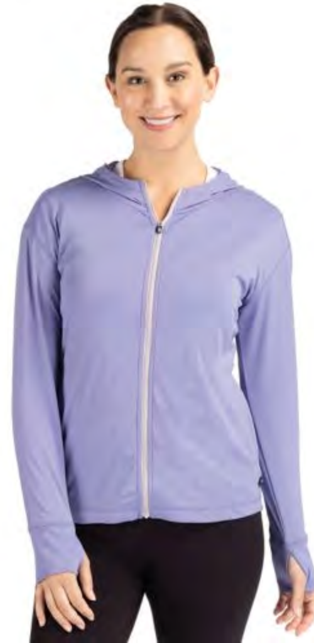
Daybreak Eco Recycled Womens Full Zip Hoodie