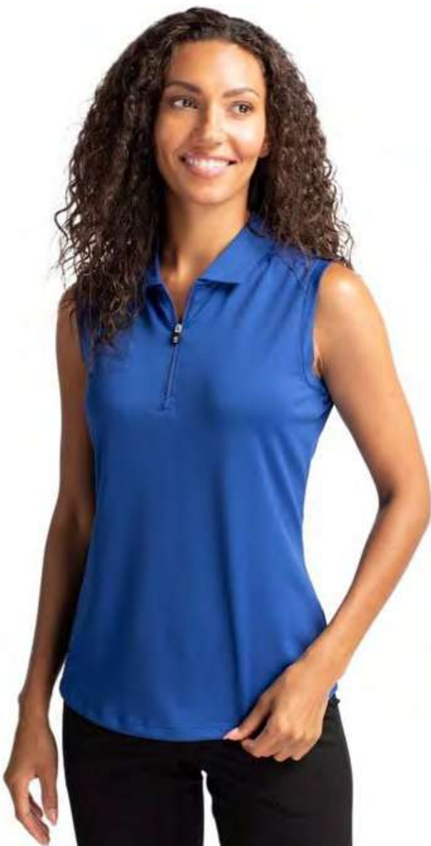
Forge Stretch Women's Sleeveless Polo LCK00074 $80 MSRP

Supremely soft and stretchy with a modern clean look, the high quality Forge product series gives you the ultimate in performance, comfort and style.