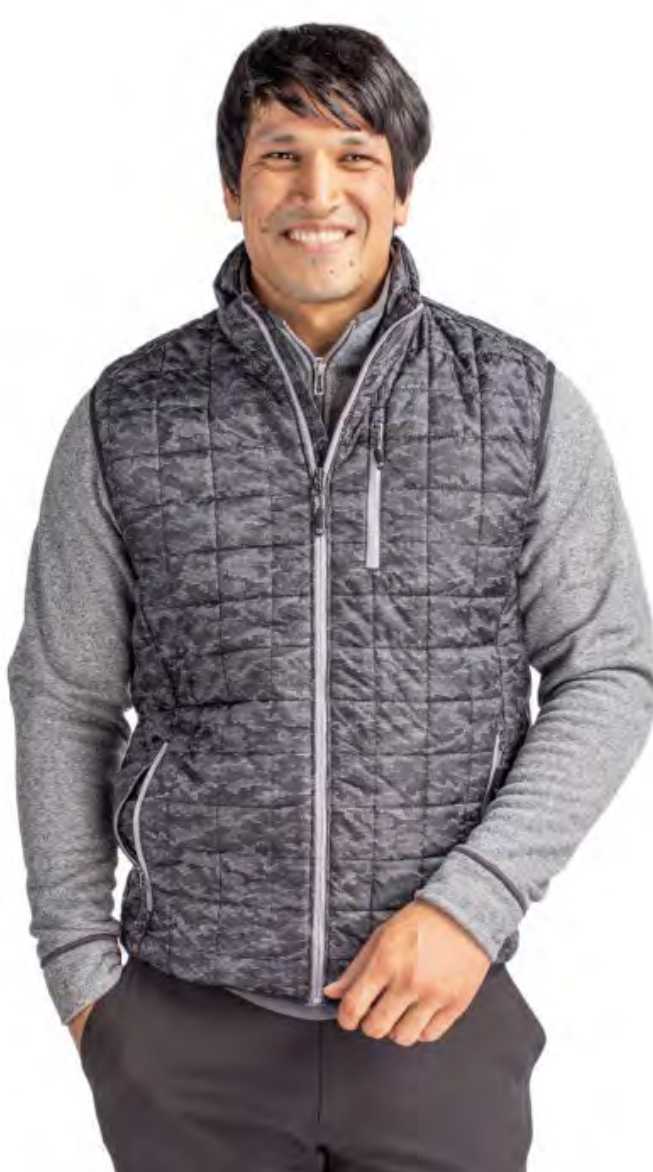
Rainier Eco Insulated Men's Full Zip Printed Puffer Vest MCO00069 $200 MSRP