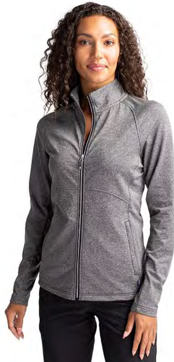
NEW Adapt Eco Knit Heather Recycled Women's Full Zip