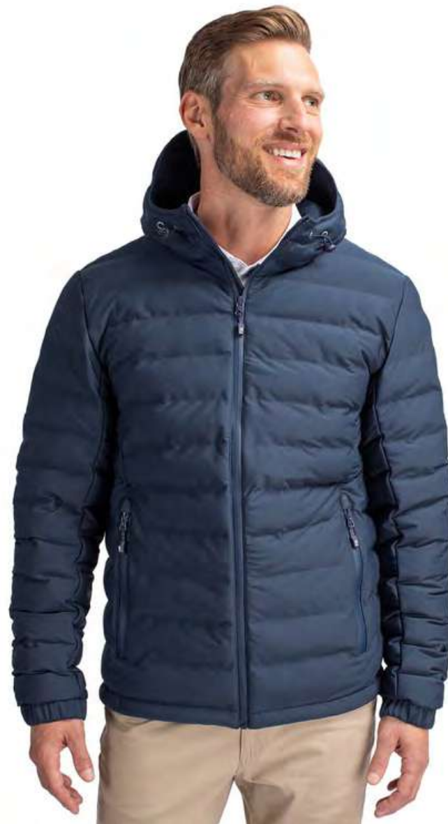
Mission Ridge Eco Insulated Men's Puffer Jacket