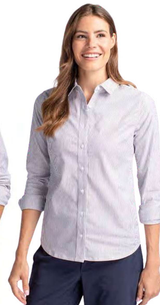
Stretch Oxford Stripe Women's Long Sleeve Dress Shirt