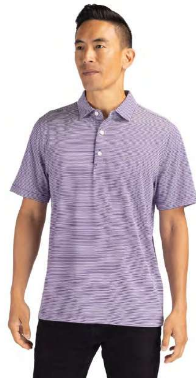
Forge Eco Double Stripe Stretch Recycled Mens Polo