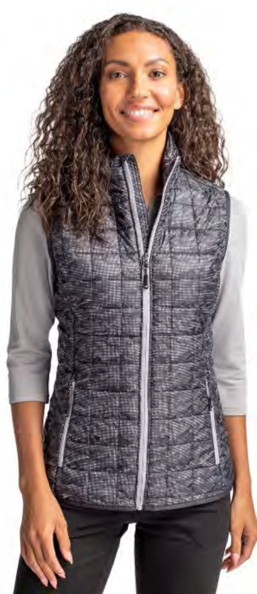
Rainier Eco Insulated Women's Full Zip Printed Puffer Vest LCO00054 $200 MSRP