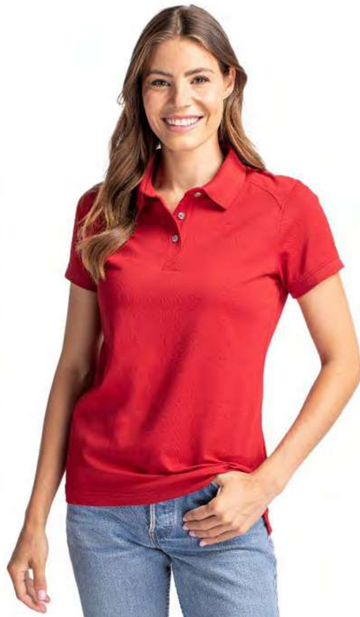
Advantage Tri-Blend Pique Women's Polo