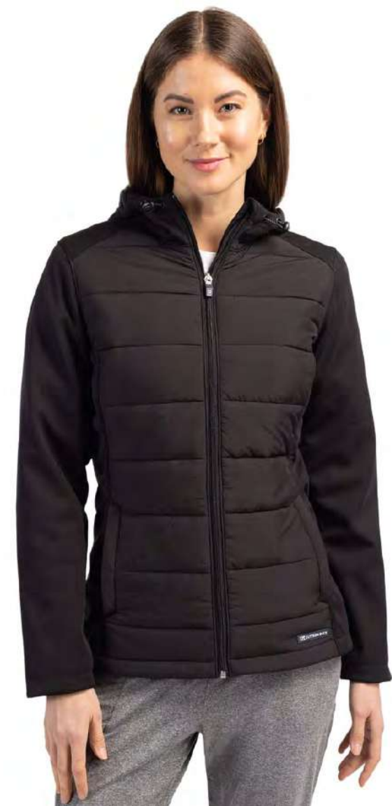
Evoke Hybrid Eco Softshell Recycled Full Zip Womens Hooded Jacket LCO00064 $245 MSRP

The iconic Evoke Hybrid Eco Series is engineered for exceptional versatility, designed as your favorite year round piece for your active life: work, golf, tennis, travel, or any everyday adventure.