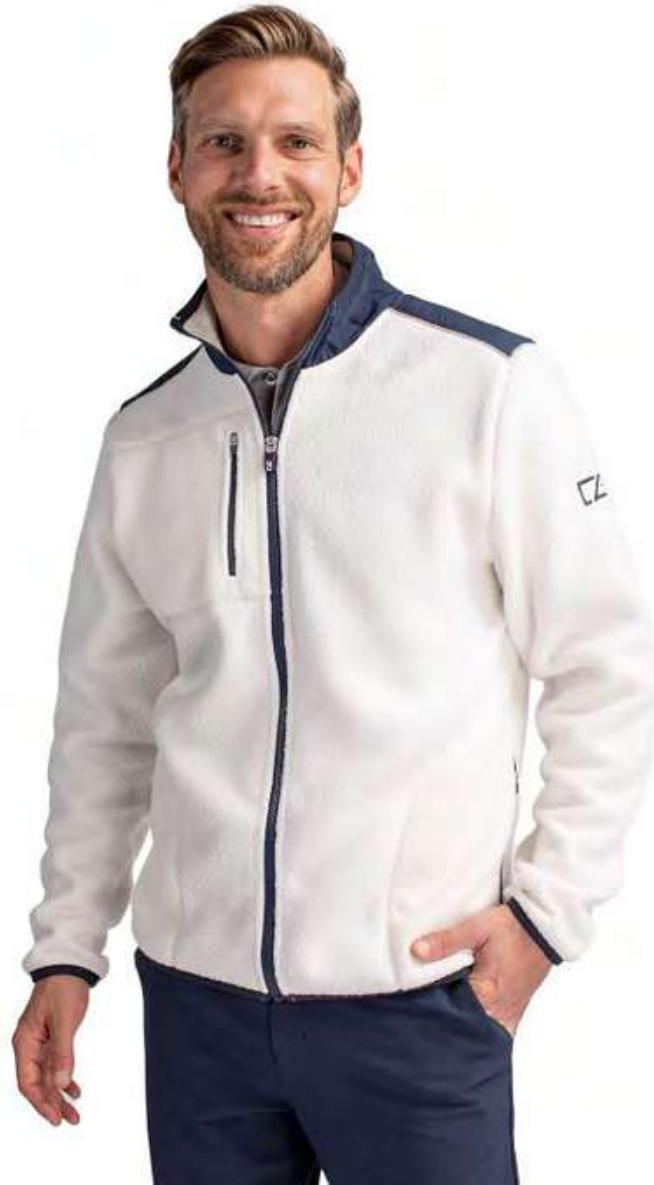
Cascade Eco Sherpa Men's Fleece Jacket

Engineered for exceptional warmth and versatility, the high quality deep pile Cascade Eco Sherpa Fleece is incredibly comfortable, with brushed fleece inside for a cozy feel while maintaining breathability so you can be active and stay warm.