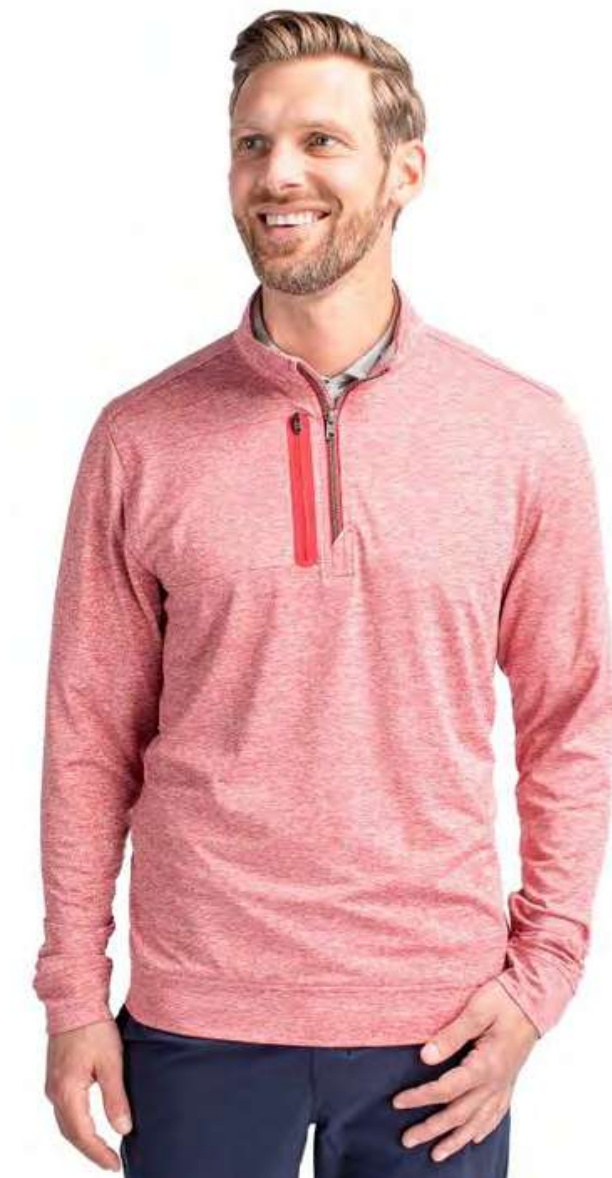
Stealth Heathered Men's Quarter Zip Pullover