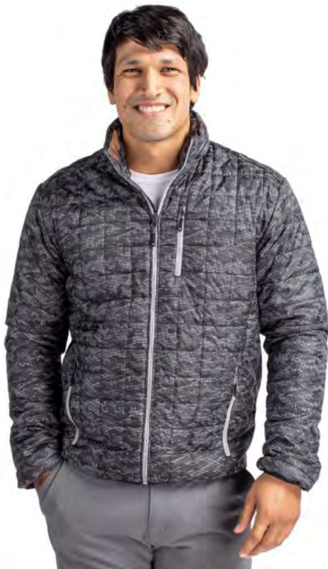
Rainier Eco Insulated Men's Full Zip Printed Puffer Jacket MCO00068 $245 MSRP

Engineered from lightweight, recycled, Primaloft® Silver Insulation for exceptional four season versatility, our Rainier jackets and vests are designed to be your favorite packable outerwear perfect for everyday travel and adventures.