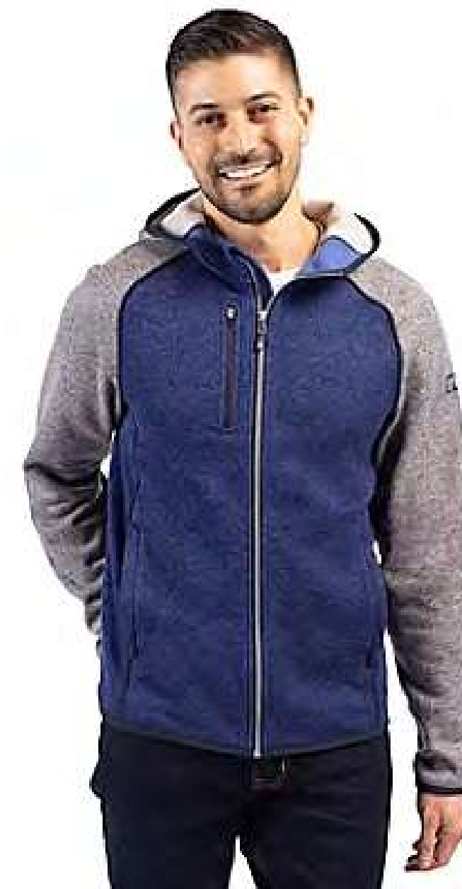
Mainsail Full Zip Hooded Mens Jacket