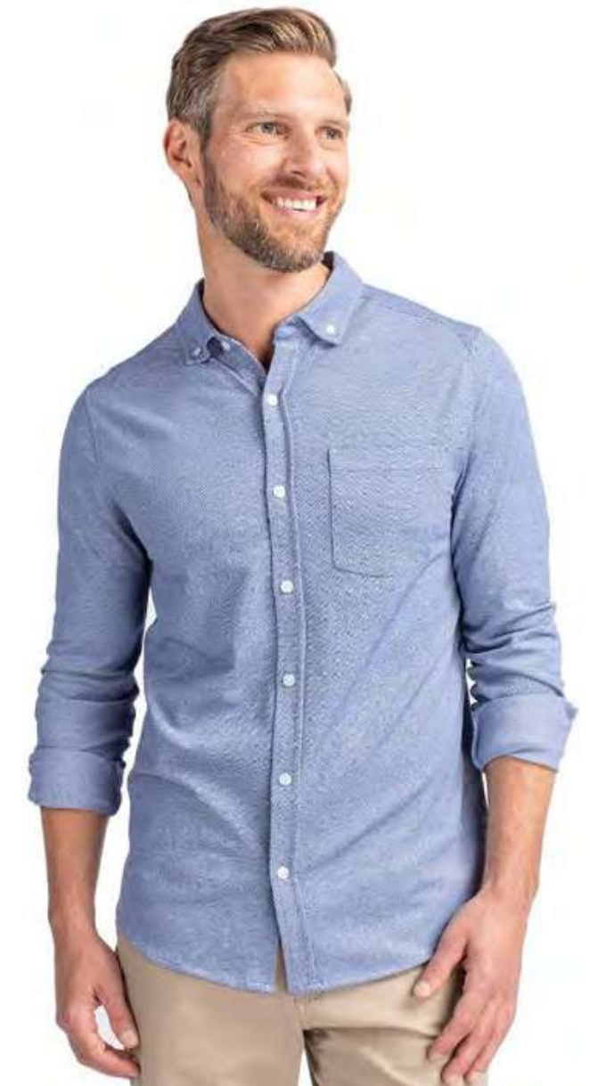
Advantage Tri-Blend Pique Knitted Men's Button Down