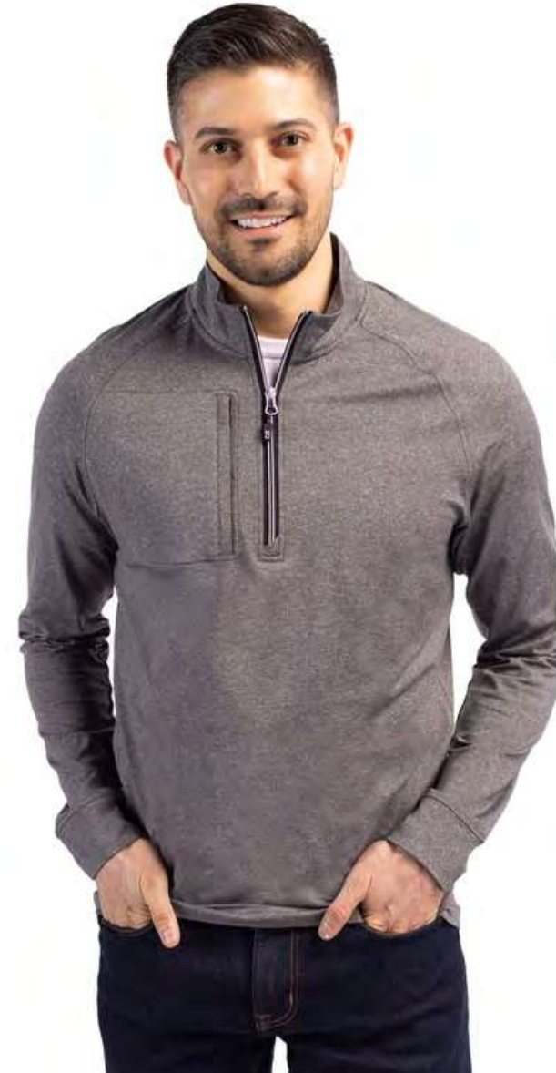
NEW Adapt Eco Knit Heather Men's Quarter Zip Pullover