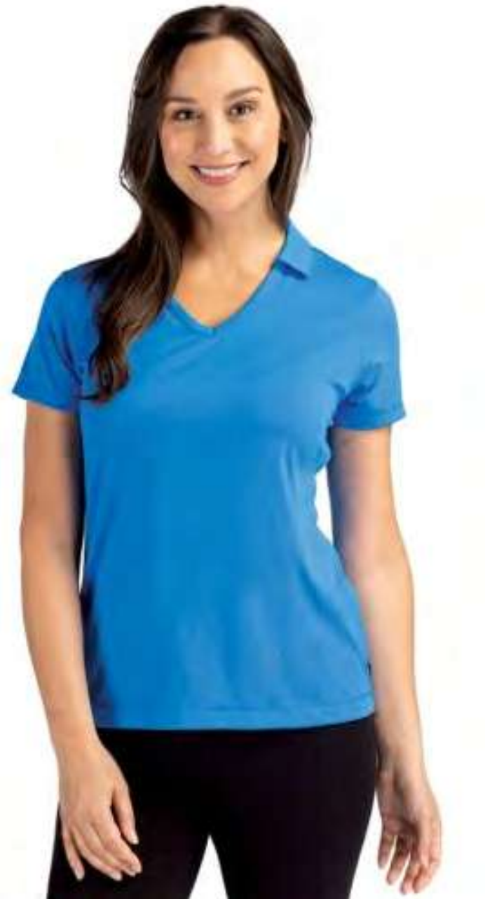
Daybreak Eco Recycled Womens V-neck Polo

Our ultra-lightweight, high quality, moisture wicking, certified eco-friendly recycled polyester is blended with spandex to provide four-way stretch, a cooling effect, and UPF sun protection, resulting in the most versatile, sustainable, and comfortable top for you and the planet.