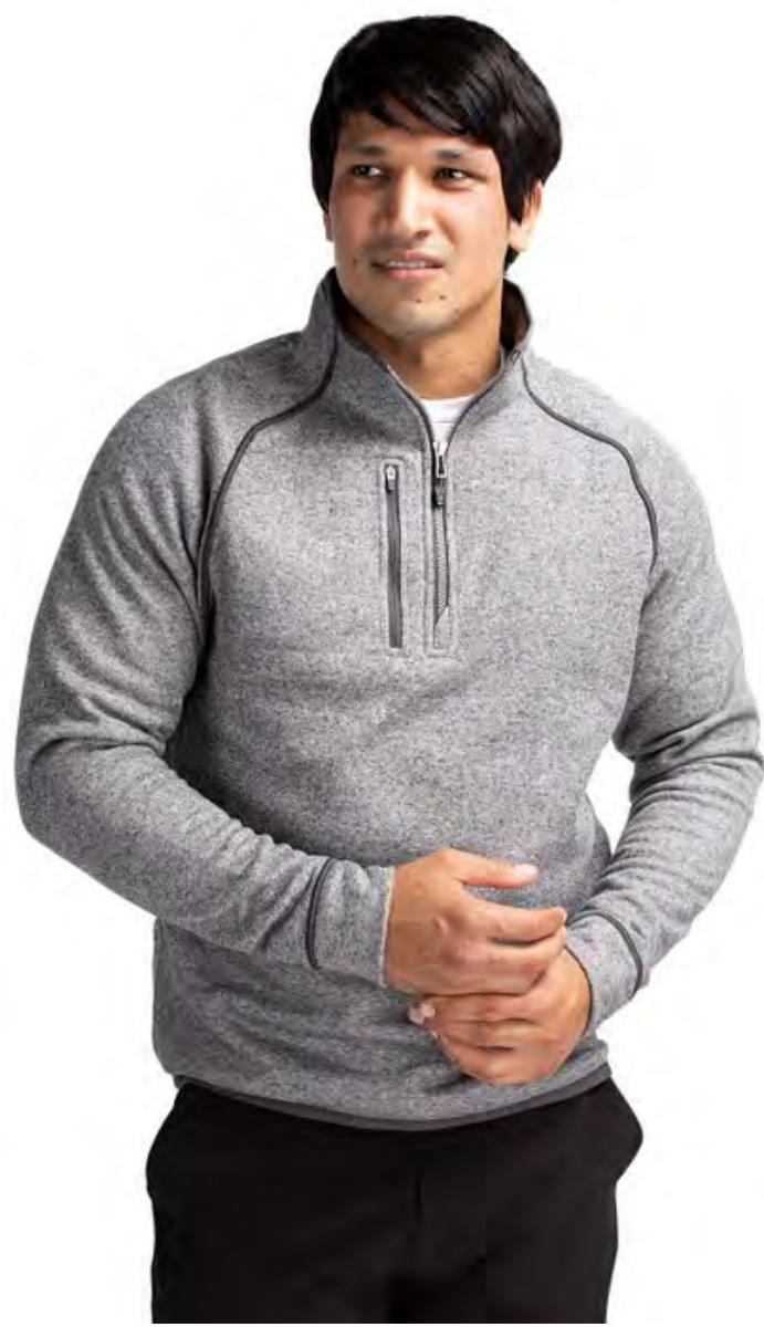
Mainsail Sweater-Knit Men's Half Zip Pullover