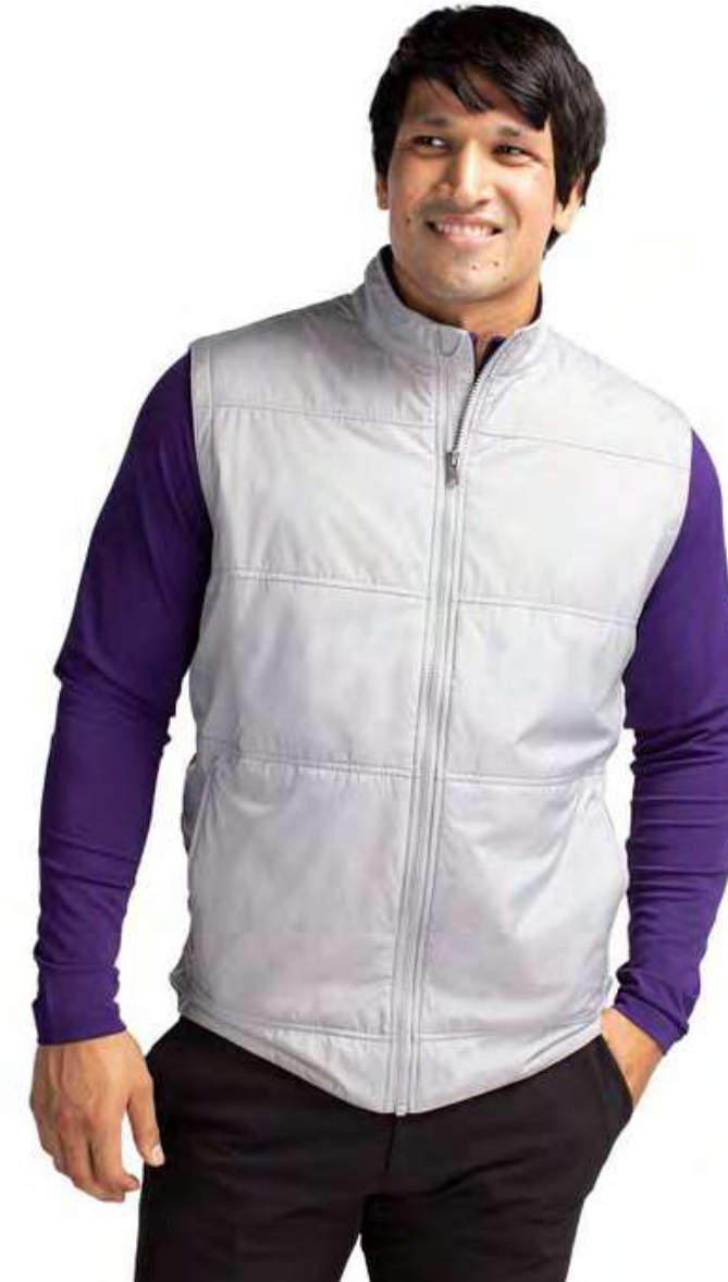
Stealth Hybrid Quilted Men's Windbreaker Vest