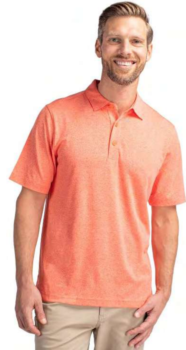
Forge Heathered Stretch Men's Polo