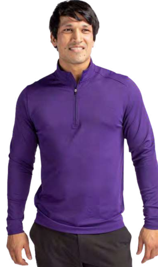
Virtue Eco Pique Recycled Men's Quarter Zip