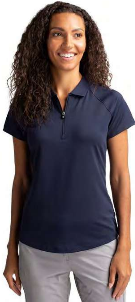
Forge Stretch Women's Short Sleeve Polo

Supremely soft and stretchy with a modern clean look, the high quality Forge product series gives you the ultimate in performance, comfort and style.