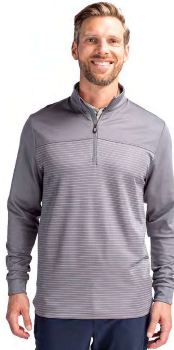
Traverse Stripe Stretch Quarter Zip Men's Pullover