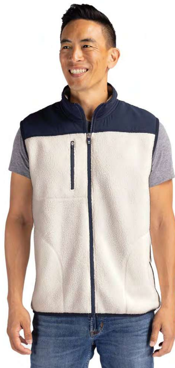
Cascade Eco Sherpa Fleece