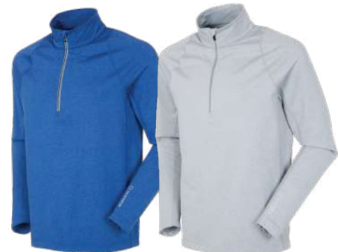
2390M Blue Stone Mélange