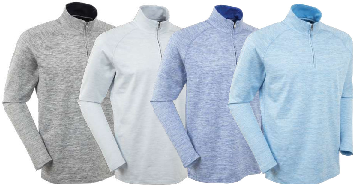
001 Black NEW