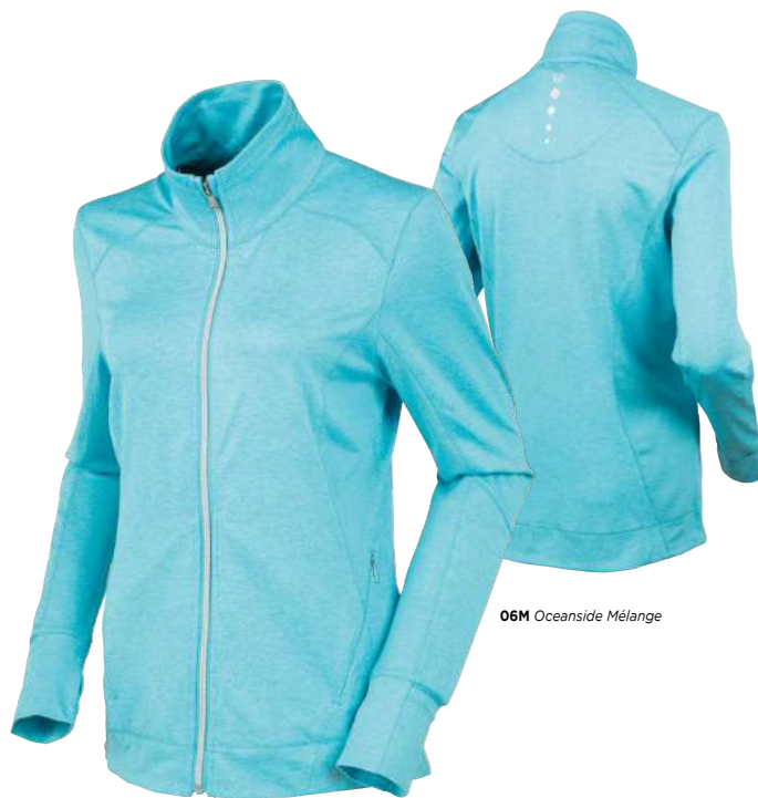
06M Oceanside Mélange