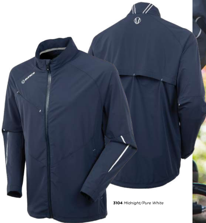
3104 Midnight/Pure White