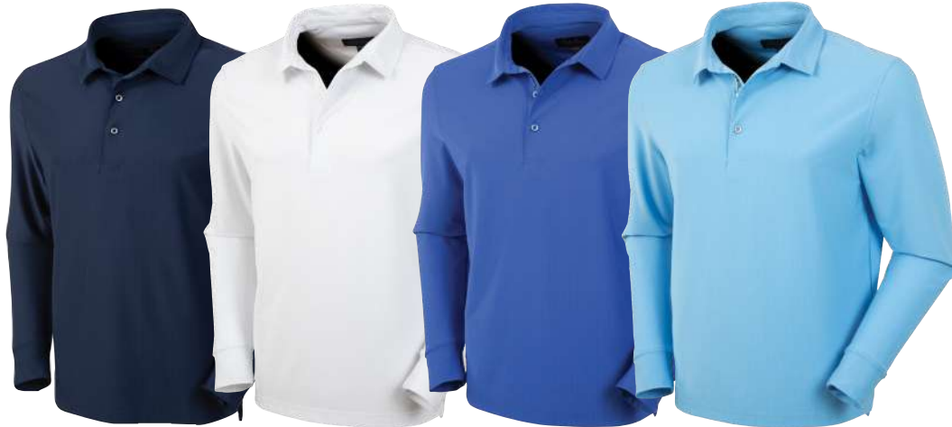
993 Summer Navy