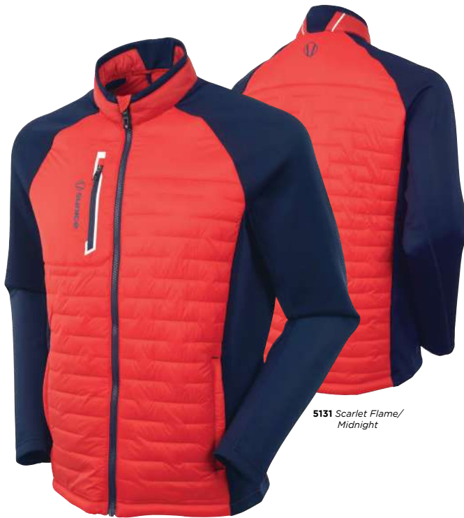
5131 Scarlet Flame/ Midnight

How can water-repellent, windproof outerwear be so light and flexible yet provide so much warmth? It's the genius of Sunice fiber technology. The fill is as thin and warm as natural down, but without the allergens, radiating continual warmth, even in wet conditions. Strategically placed stretch fabric lets you move every which way on hiking trails, bike paths, golf courses, or wherever you want to be on chilly days.