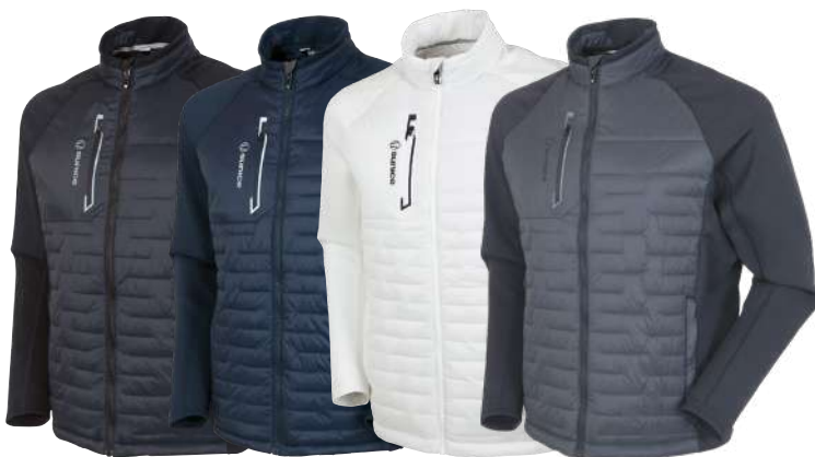
0286 Black/ Magnesium