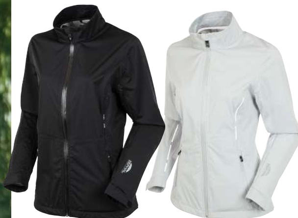
0285EM Black Embossed/Charcoal