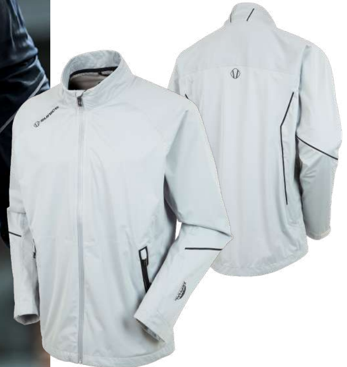
8602 Magnesium/Black (XS-3XL)