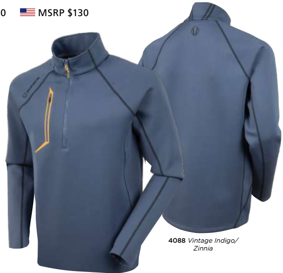
4088 Vintage Indigo/ Zinnia