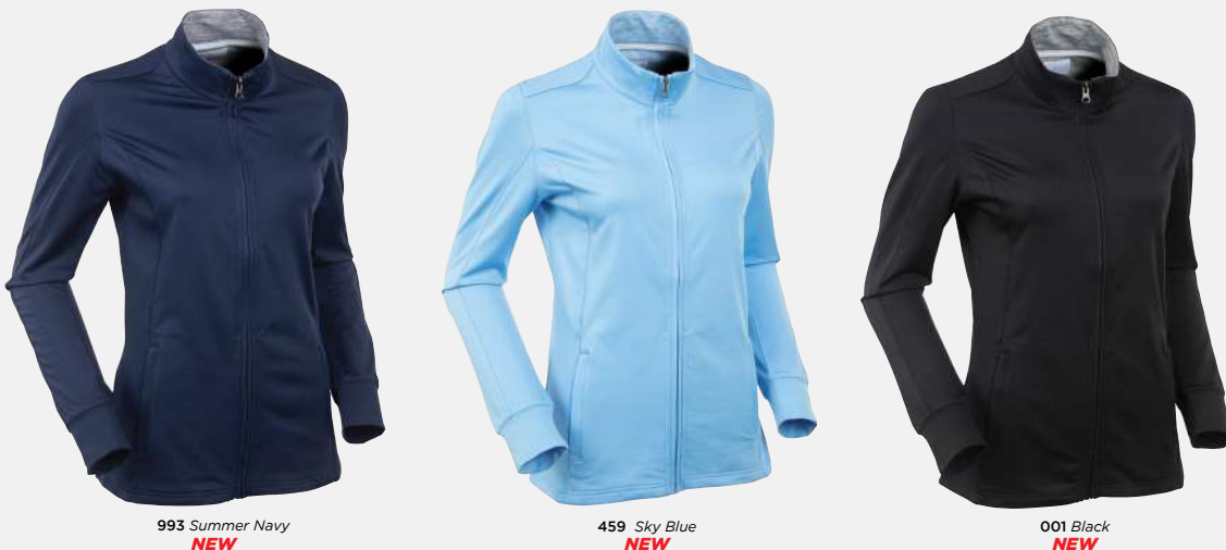
993 Summer Navy NEW