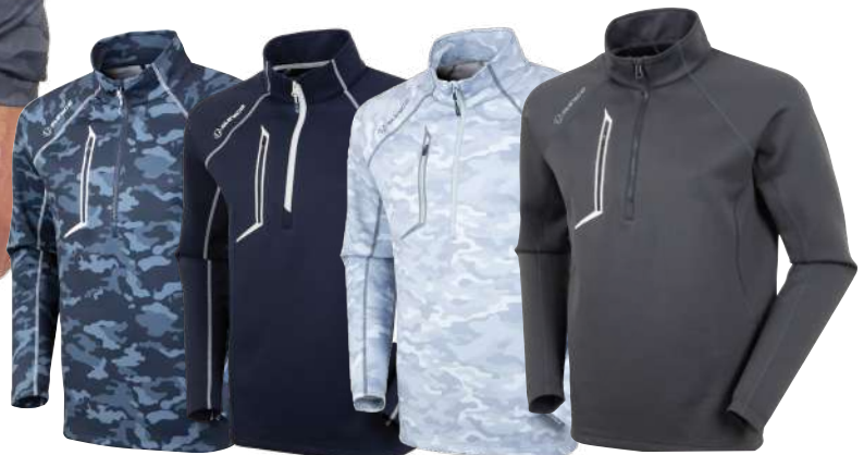
310C Midnight Camo