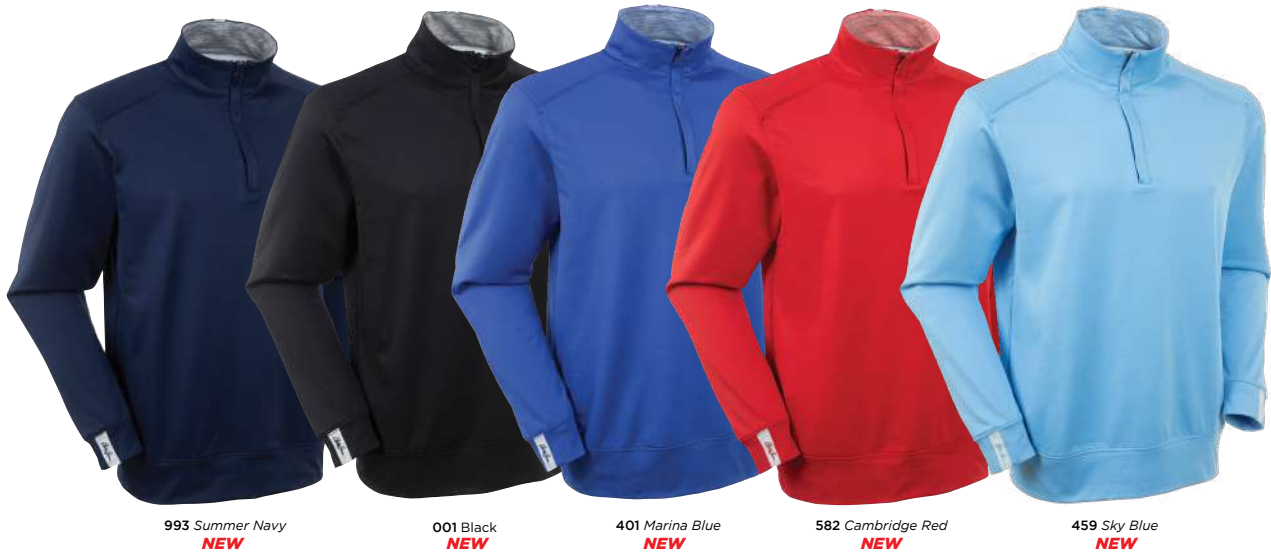
993 Summer Navy NEW