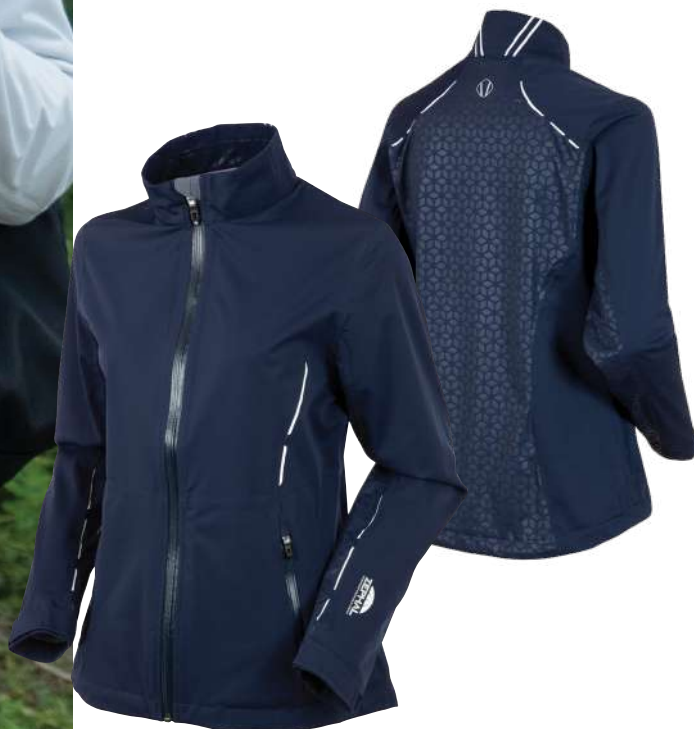
3104EM Midnight Embossed/Pure White