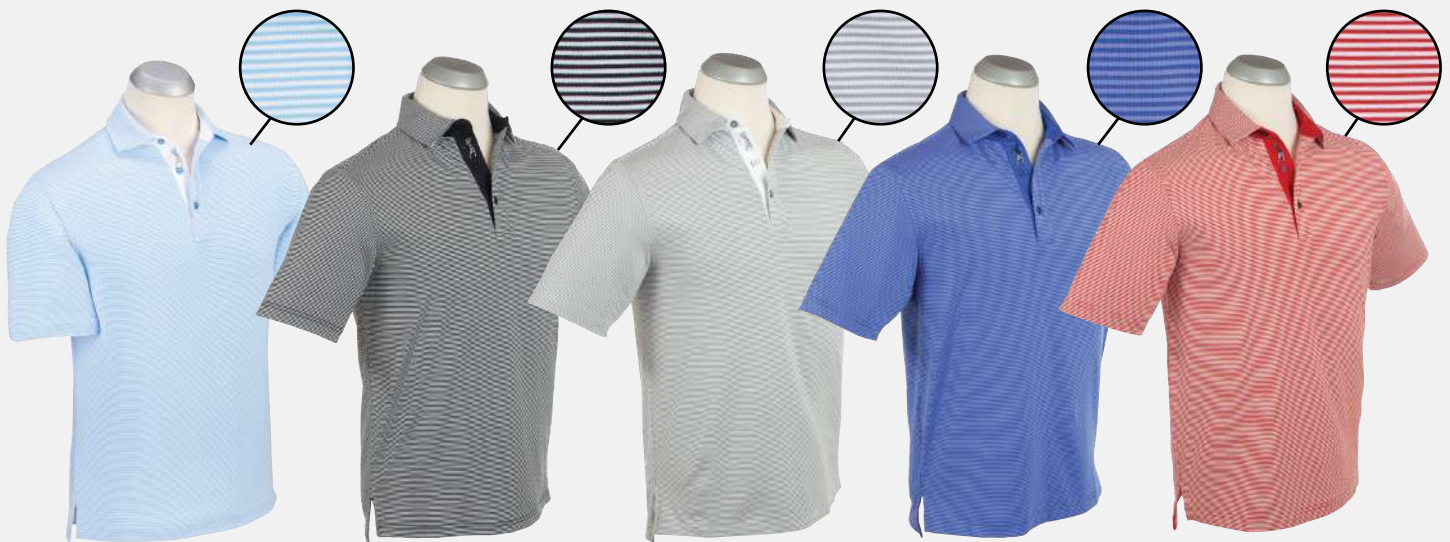
459 Sky Blue