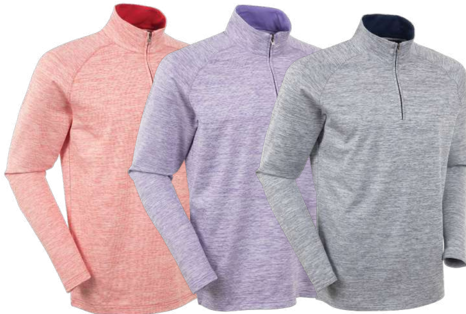
582 Cambridge Red NEW