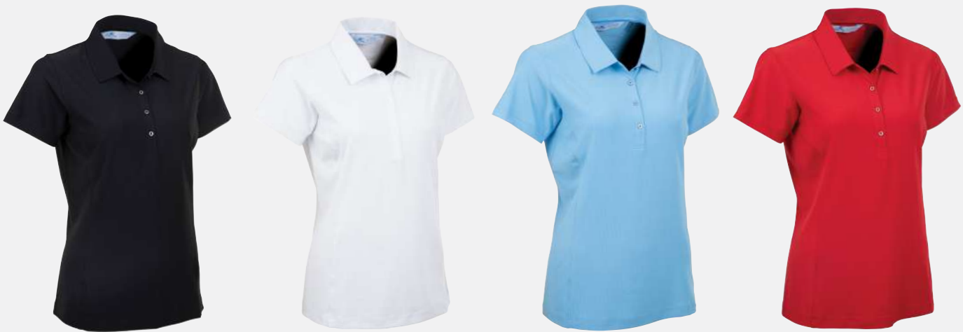
001 Black NEW