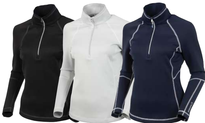
0285 Black/ Charcoal