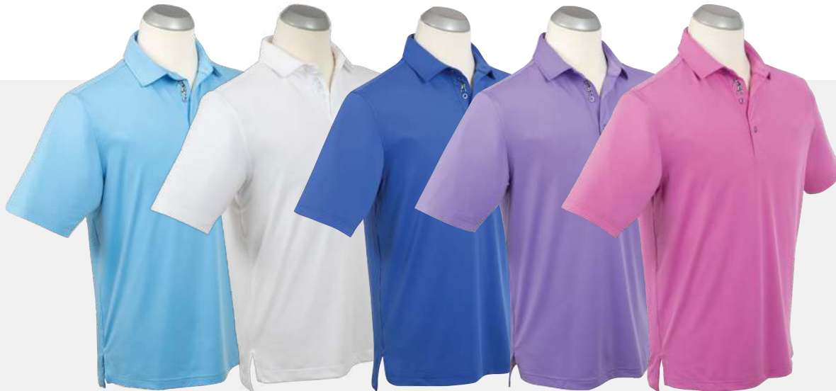
459 Sky Blue