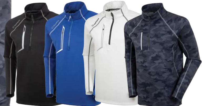
0282 Black/ Ombre