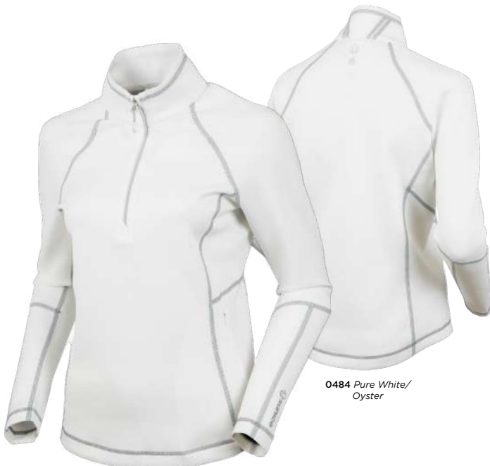
0484 Pure White/ Oyster