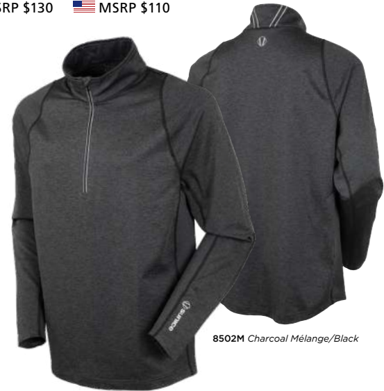
8502M Charcoal Mélange/Black