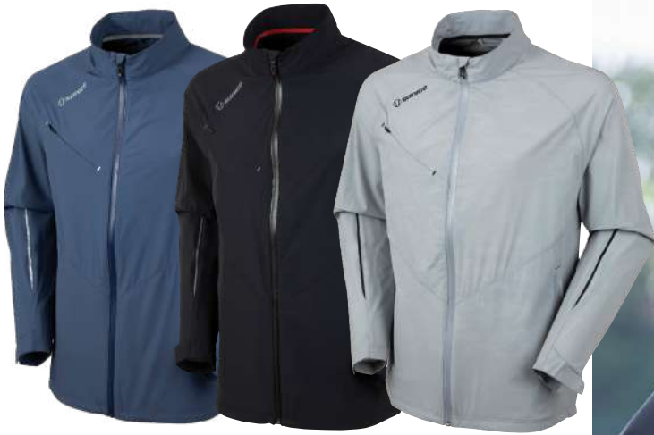
40 Vintage Indigo