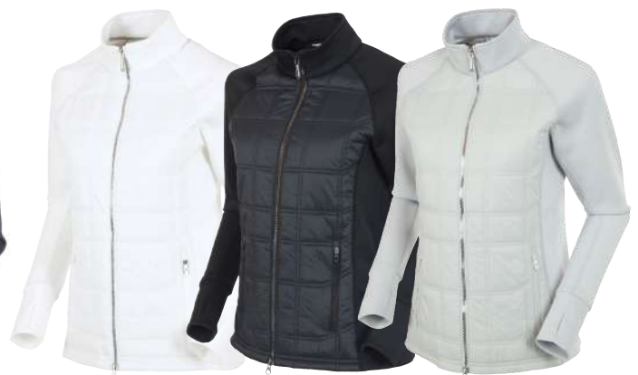
0404 Pure White with silver zipper