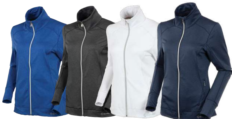
23M1 Blue Stone Mélange 85M1 Charcoal Mélange 04 Pure White 31M Midnight Mélange